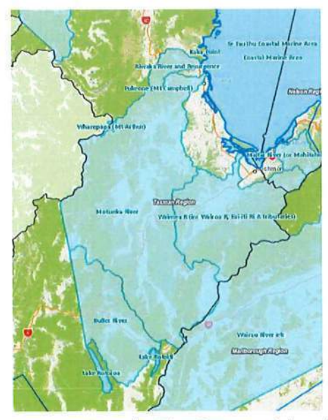
Figure 1: Ngāti Rārua Motueka River Statutory Acknowledgement

11. Ngāti Rārua have a statutory acknowledgement over the Motueka awa and its tributories. A statutory acknowledgment is legal recognition of the particular cultural, spiritual, historical and traditional association of an iwi with an identified statutory area. Statutory acknowledgements enhance the ability of iwi to participate in Resource Management Act 1991 process.