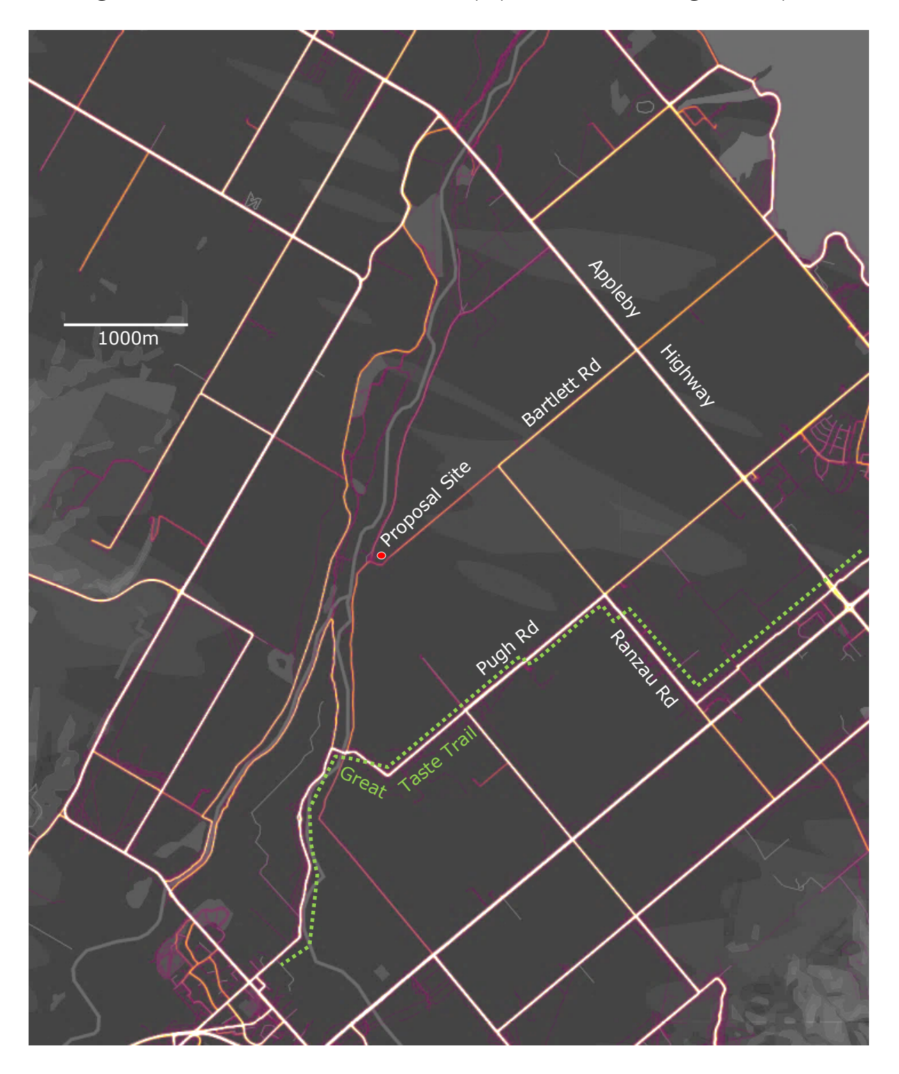
Figure 1: Strava heatmap for cycling, 24 months of cumulative data to August 2021, showing location of Tasman Great Taste Trail (adjacent to the dotted green line).