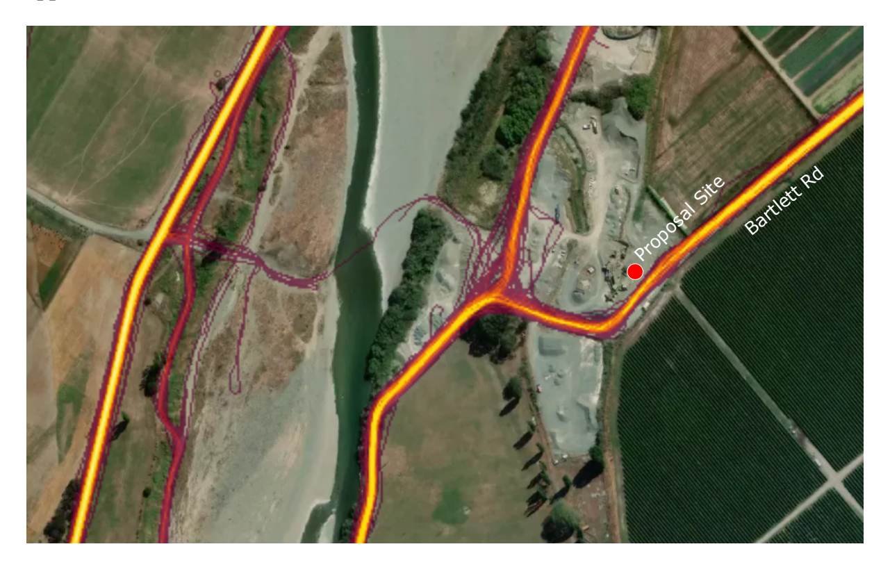
Figure 4: Strava heatmap for running, 24 months of cumulative data to August 2021, at application site.

Figure 3: Strava heatmap for cycling, 24 months of cumulative data to August 2021, at application site.