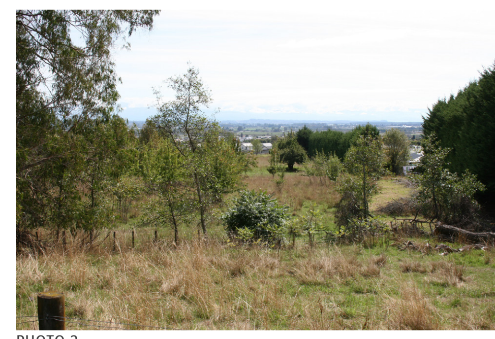
LOOKING DOWN FROM HILL STREET DOWN THE CENTRE OF THE SITE WITH THE EXISTING DEVELOPMENT IN THE DISTANCE. THE SITE BOUNDARY FOLLOWS THE DISTANT TREES ON THE RIGHT