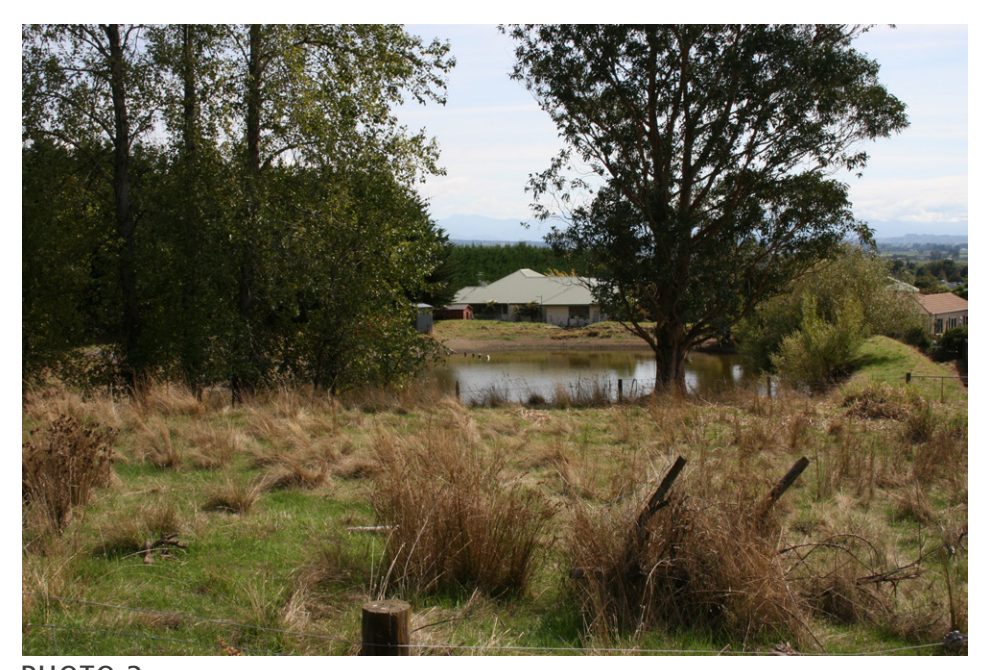
РНОТО 3 LOOKING DOWN FROM HILL STREET OVER EXISTING POND WHICH IS WHERE THE CARE FACILITY WILL BE POSITIONED. SITE BOUNDARY IS JUST TO THE RIGHT OF THE POND AND CUTS IN BEFORE THE HOUSE