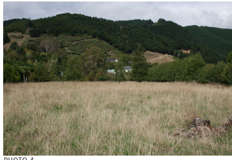
PHOTO 4 LOOKING SOUTH-EAST UP THE SITE FROM THE EXISTING DEVELOPMENT