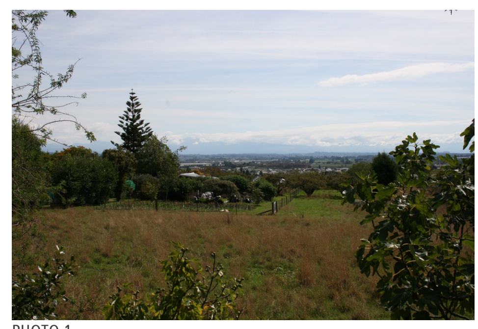
LOOKING NORTH-WEST DOWN FROM HILL STREET WITH SITE BOUNDARY FOLLOWING EXISTING FENCELINE