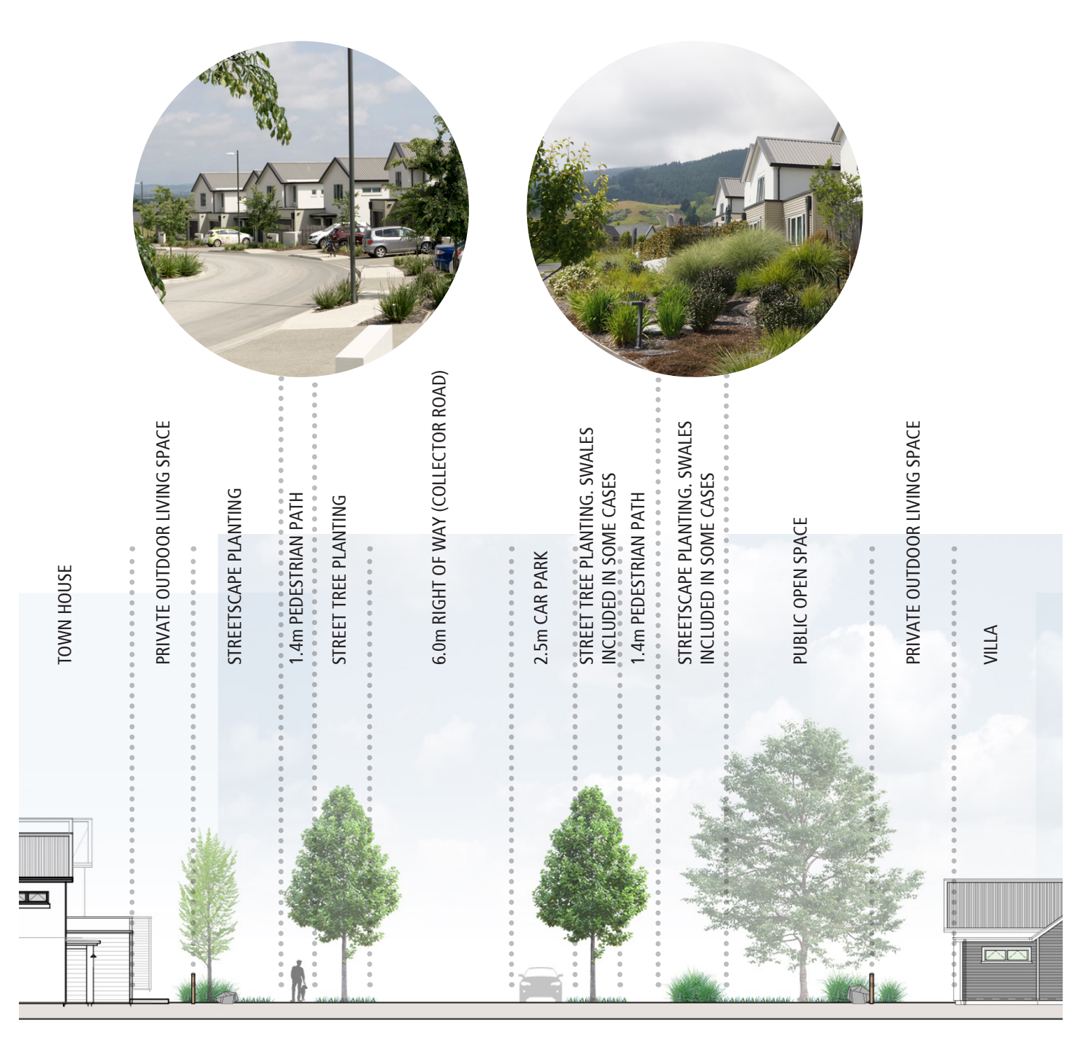
6 METRE RIGHT OF WAY (COLLECTOR ROAD) | SECTION C-C