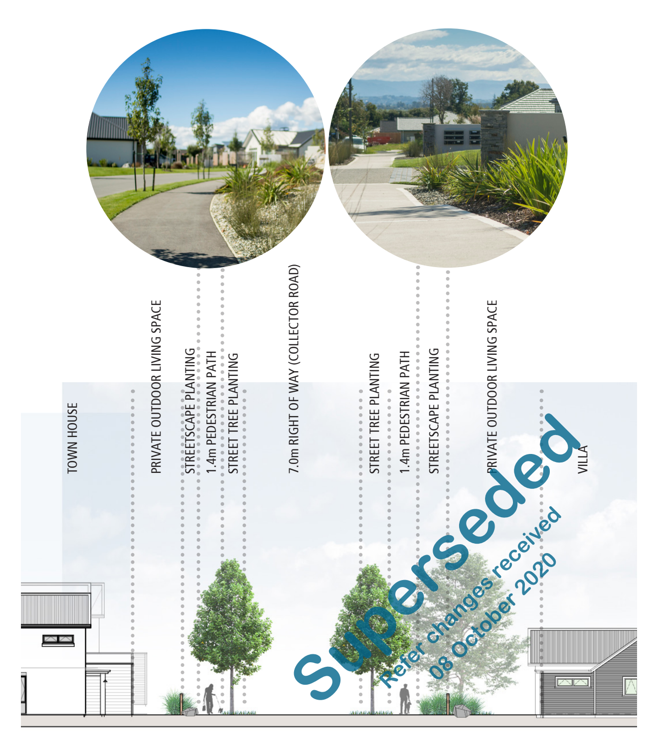
7 METRE RIGHT OF WAY (COLLECTOR ROAD) | SECTION D-D