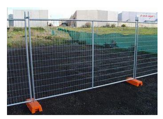
Figure 1: Temporary site fencing.

In all cases, rejected material will be returned to source or directed to an approved disposal facility.