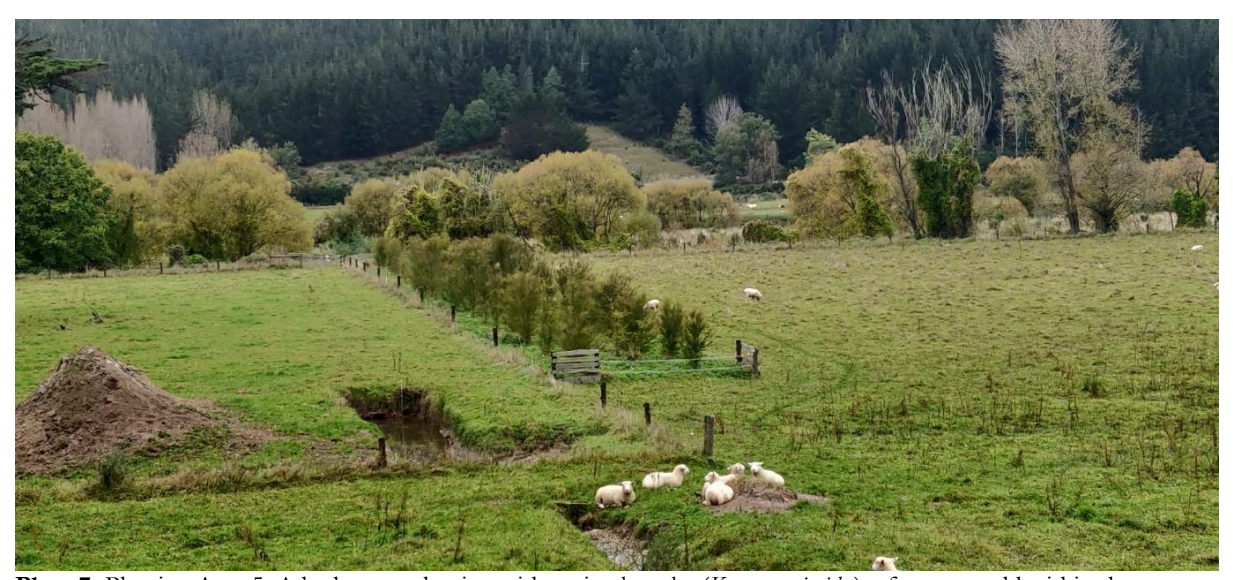
Plate 7. Planting Area 5. A hedgerow planting with native kanuka ( Kunzea ericoides ) a few years old within the Motueka River floodplain that has established successfully. This planting is in area that is subject to a similar frequent and intensive of flooding to that of the proposed mitigation planting area on site.