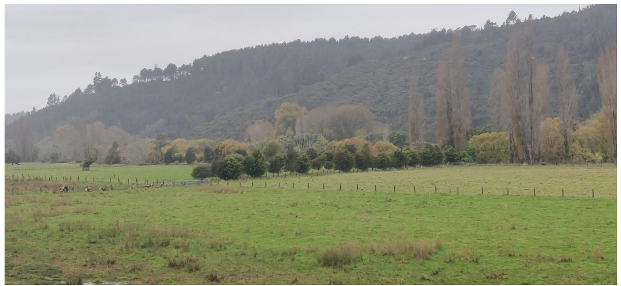
Plate 6. Planting Area 4. A hedgerow planting with native kanuka ( Kunzea ericoides ) many years old within the Motueka River floodplain that has established successfully. This planting is in area that is subject to a similar frequent and intensive of flooding to that of the proposed mitigation planting area on site.