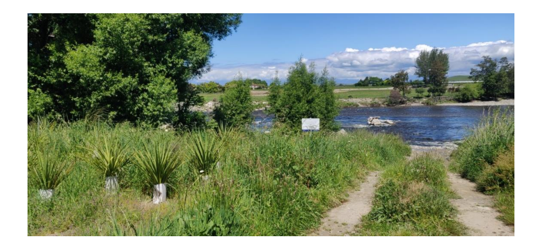
Plate 1. Planting Area 1. A restoration planting several years old adjacent to the Motueka River that has established successfully. This planting is in area that is subject to more frequent and intensive flooding than that at the proposed mitigation planting area on site. The Motueka River is in the background.