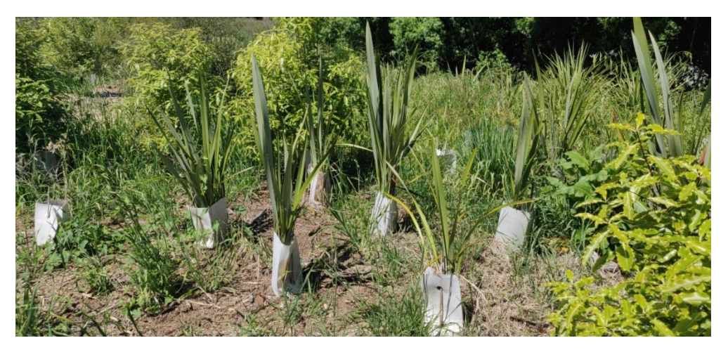
Plate 3. Planting Area 1. Harakeke planted with protective cardboard guards that are effective in the floodplain. Note the presence of recent flood debris surrounding these plants.