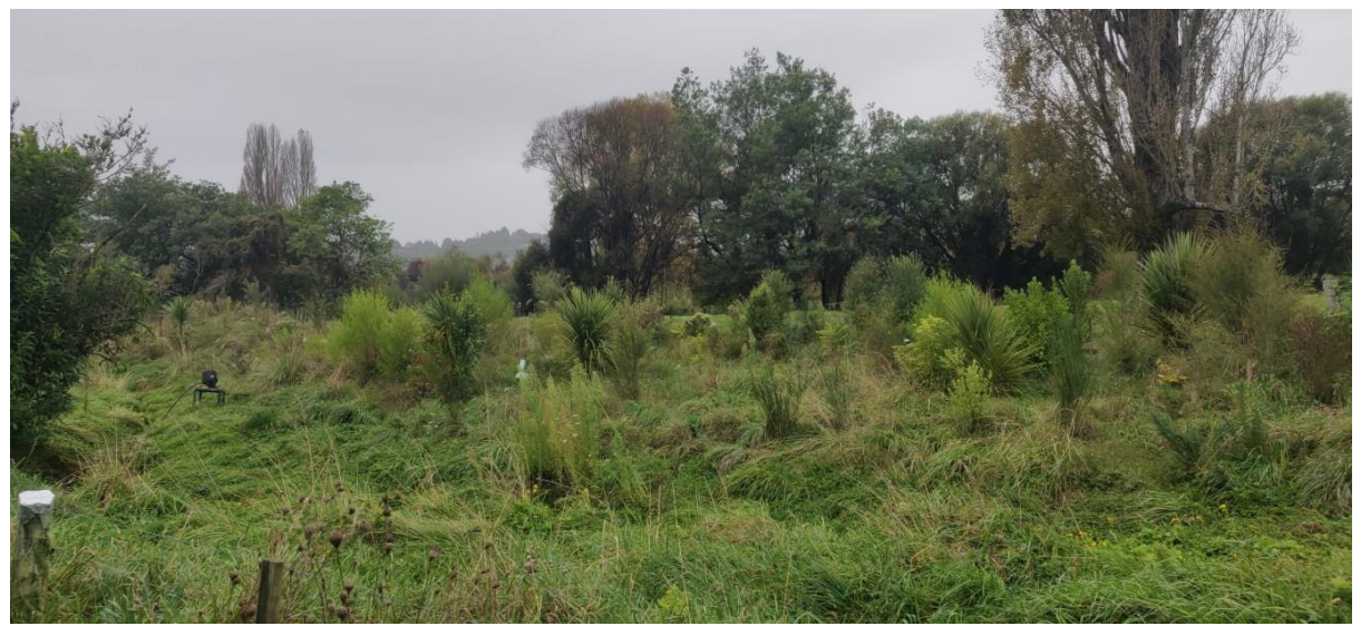
Plate 4. Planting Area 2. A restoration planting several years old within the Motueka River floodplain that has established successfully. This planting is in area that is subject to a similar frequent and intensive of flooding to that of the proposed mitigation planting area on site.