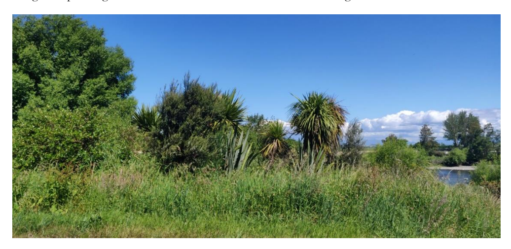
Plate 2. Planting Area 1. A restoration planting approximately 10 years old adjacent to the Motueka River in area that is subject to flooding and has established successfully. The Motueka River is in the background.