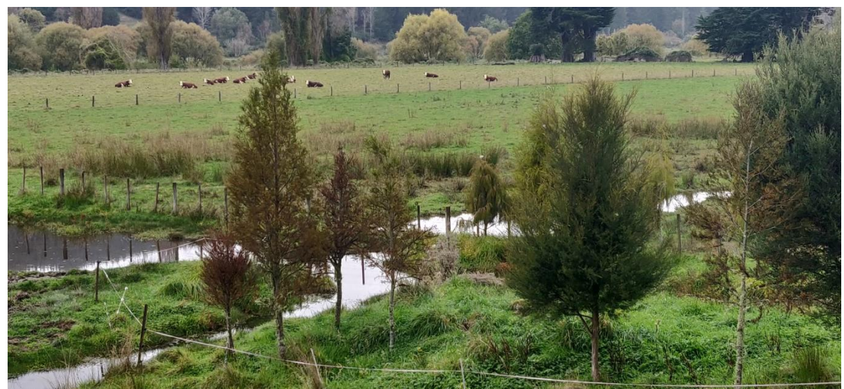
Plate 5. Planting Area 3. A restoration planting several years old within the Motueka River floodplain that has established successfully. This planting is in area that is subject to a similar frequent and intensive of flooding to that of the proposed mitigation planting area on site.