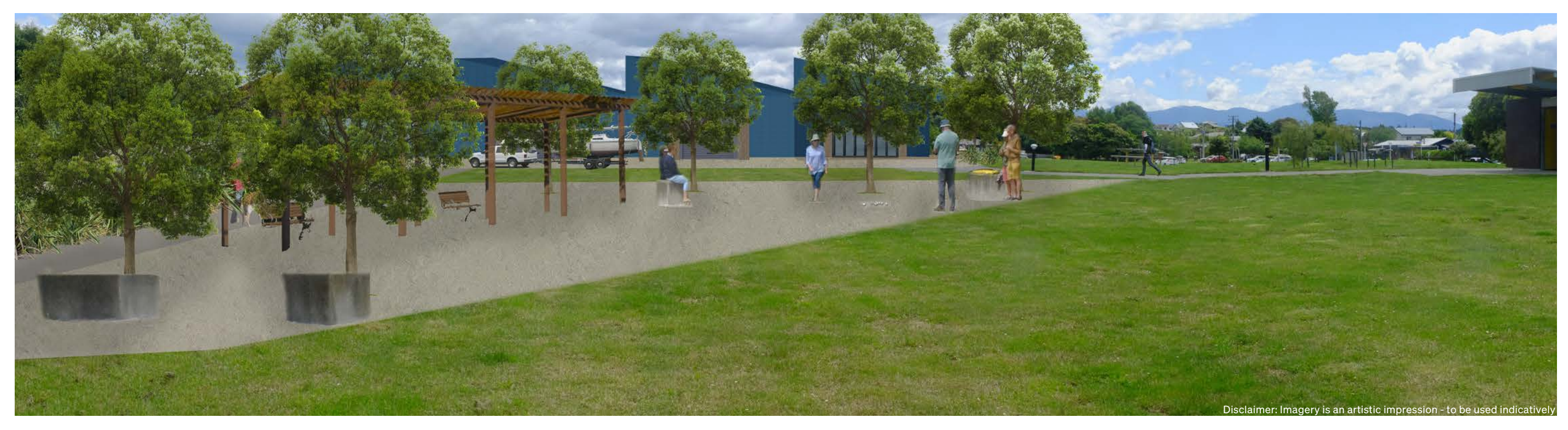
Viewpoint Location Photograph 6: Proposed view from within Waterfront Park (distance of 50m)