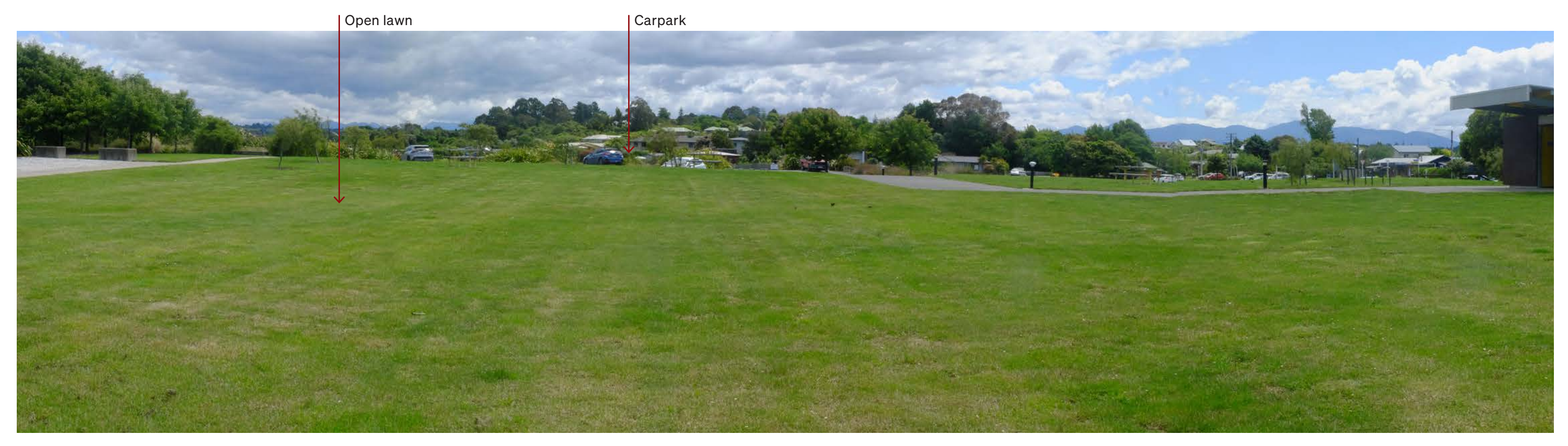
Viewpoint Location Photograph 6: Existing view from within Waterfront Park