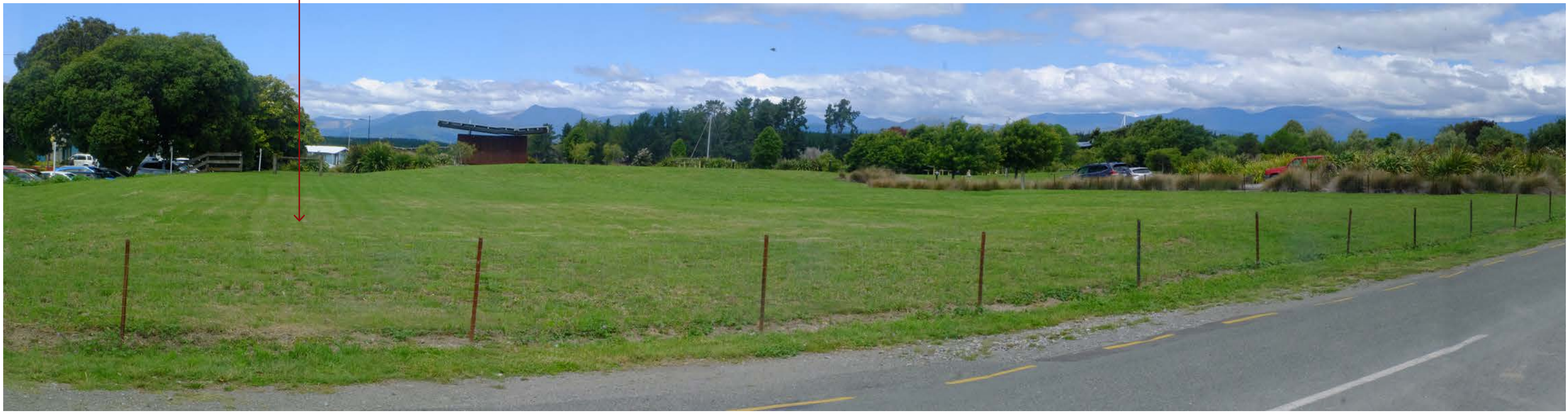
Viewpoint Location Photograph 5: Existing view from Tahi Street towards Site (distance of 60-70m)