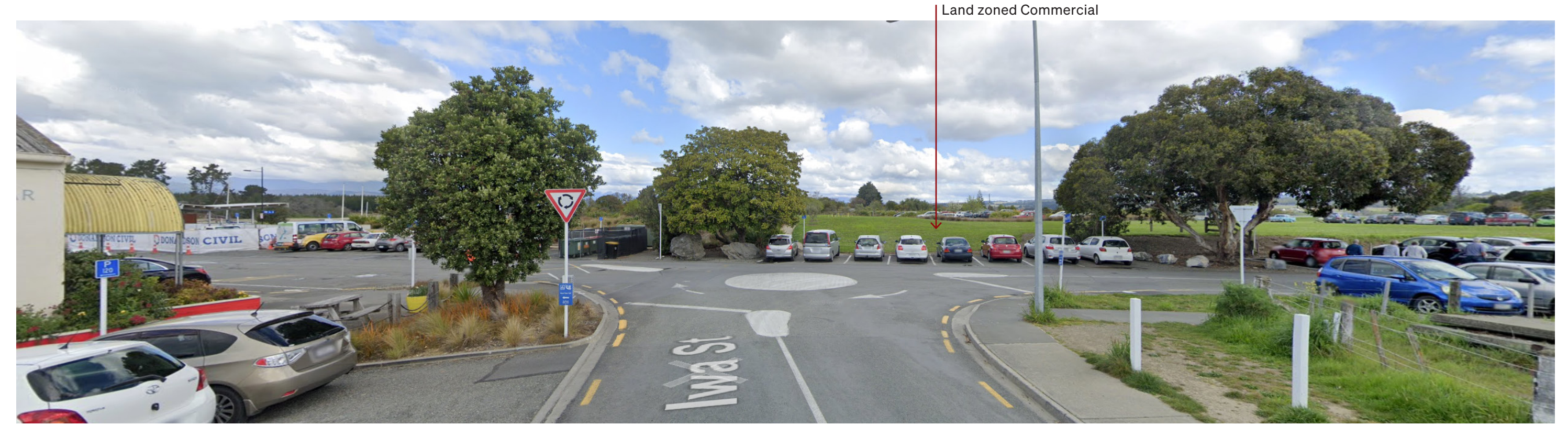
Viewpoint Location Photograph 3: Existing view from Iwa Street towards Site (distance of 85m)