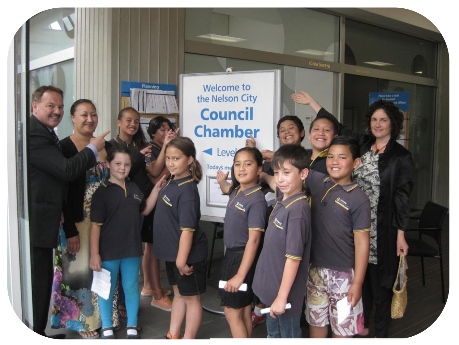
Sustainable actions at Victory School Details on page 9