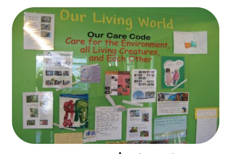
Tawa Montessori's Care Code

See Case Studies in the Enviroschools Kit, pp13-29