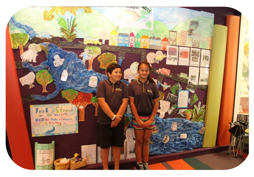
The interactive wall presentation at the Elma Turner Library, Nelson

The classes had also created an interactive wall presentation about their term's work, which is on display at Elma Turner Library, Nelson.