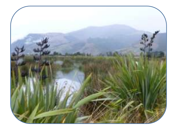
The wetlands are host to a range of wetland birds some of whom are quite shy and rare.

These seagulls fly and hover to pick out the very small pieces of corn and other little leftovers that are not blocked by the filters – really!