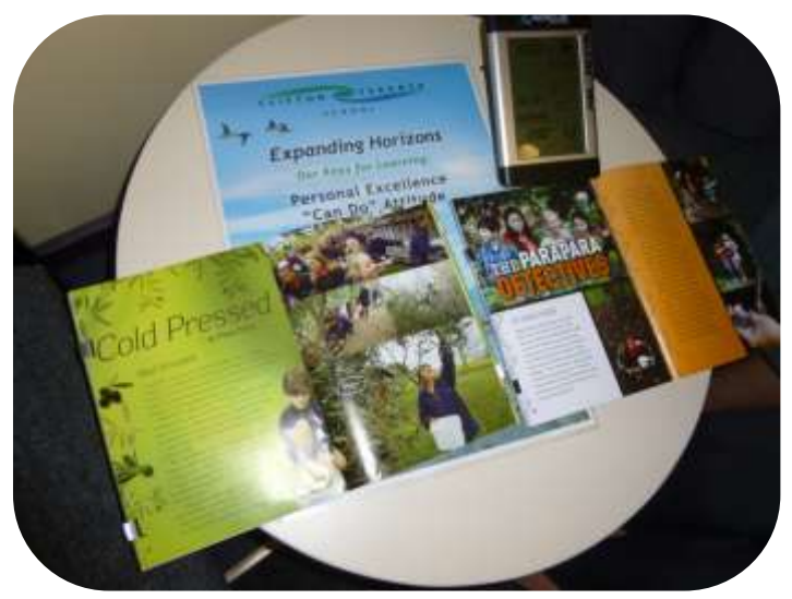
Read about the olive harvest at the school in Schools Journal: August 2013.