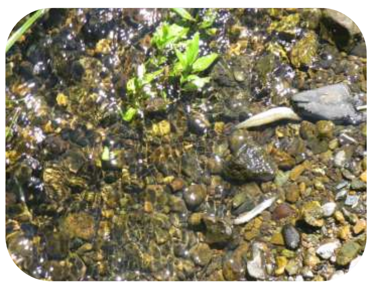
Can you spot the issue?

A member of the public did. Even though the water looked clear, there was something fishy going on! Noting the time and place, a phone call was quickly made to Council.