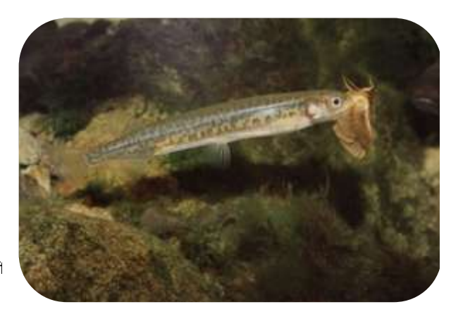
Inanga eating moth - Stephen Moore