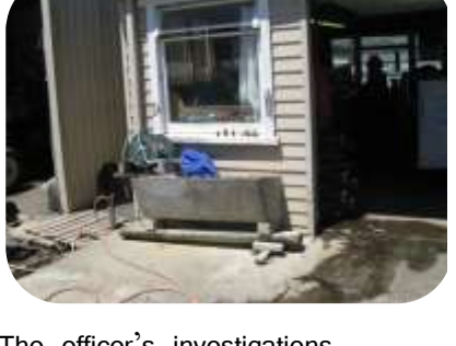
The officer's investigations eventually located the source of the pollution. Can you see what might have happened?