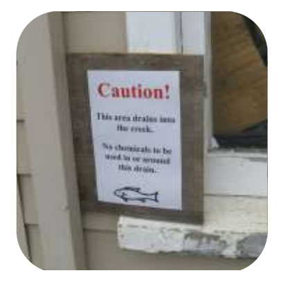
As a result, the company was fined and required to install this notice as a reminder to staff of how important it is to protect our waterways. The stream is still recovering.