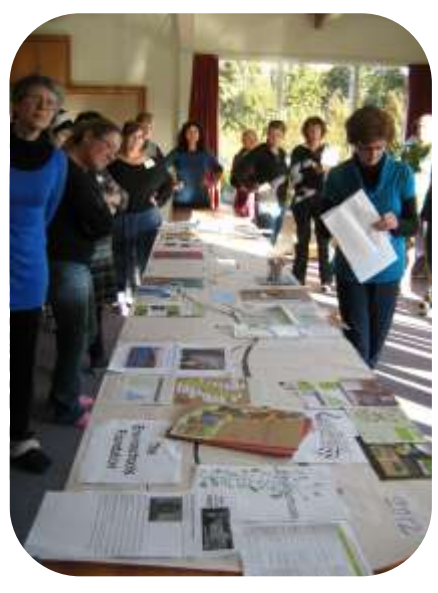
Success is not the work of one, but the work of many

Ehara taku toa I te toa takitahi Engari, he toa Takitini