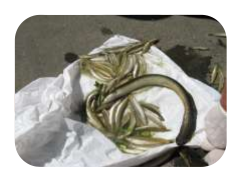
Within hours a Council compliance officer investigates and finds many more dead native fish, as well as eels.

A member of the public did. Even though the water looked clear, there was something fishy going on! Noting the time and place, a phone call was quickly made to Council.