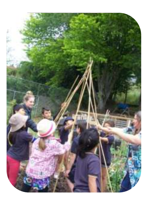
Building a tepee for the beans is fun!

Last term, the Kids Edible Gardens (KEGS) students planted zucchinis, peas, beans, tomatoes, sunflowers, and pumpkins and took seeds to plant at home. This is a great way for them to share their knowledge and enthusiasm with their families. They harvested the garlic that they had planted at Matariki and built a tepee from bamboo sticks. They learned how to plant beans either side of each pole, one finger-length deep. The school this year will move from KEGS to a new programme "Garden To Table" (GTT) that is setting up in our region. Garden To Table is very similar to KEGS, but with equal emphasis on cooking and growing. This will allow one more school to participate in KEGS, effectively increasing the number of schools growing and cooking healthy food in Nelson.