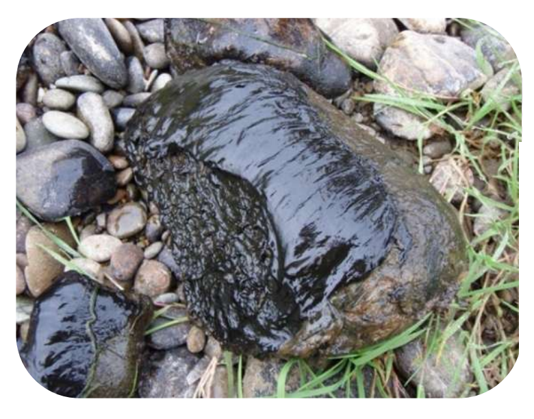
A rock removed from the stream with toxic algae on it

For more information, visit nelson.govt.nz or tasman.govt.nz and search = toxic algae.