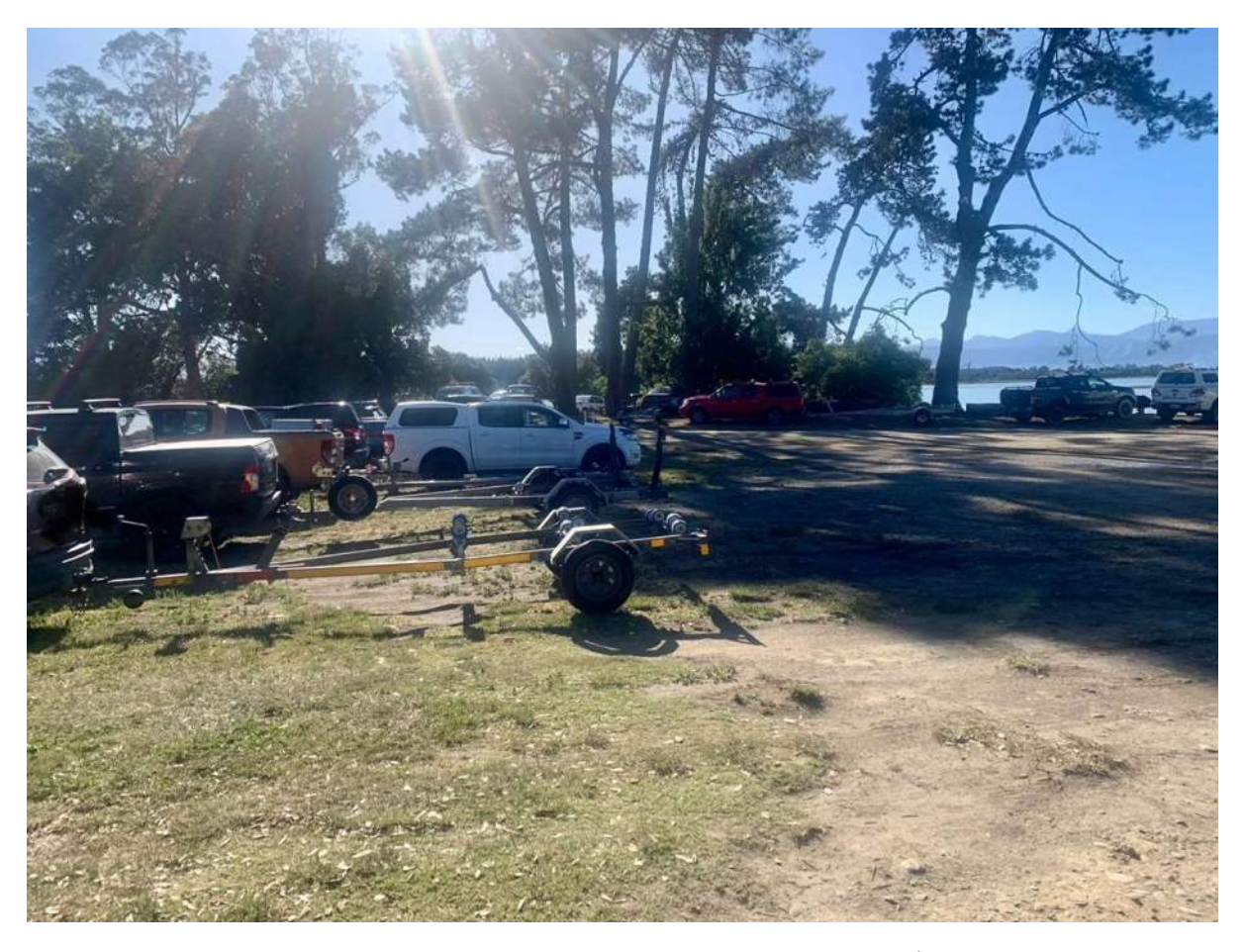
Photos of wharf jumping and boat trailers parked at Grossi Point Sunday 26<sup>th</sup> November at 8.50am to provide context for my submission. These show the large SUV's and boat trailers accessing Mapua.