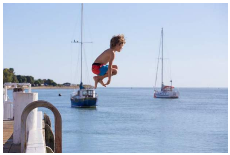
Figure 1 - My son, age seven, in 2015.

Both of my children are avid "wharf jumpers" and have been since they were little. Attached to the end of this submission is a blog by Talking Mapua called "A Mapua Institution – The Wharf Jump" published in 2015. The photos in that blog are of my son when he was aged seven (Figure 1).