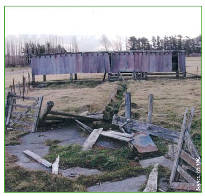
Swim through dip

Occupiers and landowners are required to take all practical steps under the Health and Safety in Employment Act 1992 to 'eliminate, isolate or minimise' any hazards to ensure the safety of their employees and contractors working on or around dips, including during any remediation activities. Landowners and occupiers also have a responsibility to ensure non-work related people, including children and visitors, do not come to harm from the dip site. Accidental drowning has occurred at a plunge dip and personal injury has been known to happen from falls and trips around dips sites. Some dip sites are situated in 'amenity land' - areas of public land or public access (e.g. camping grounds) and owners and occupiers need to ensure visitors and residents are not exposed to unnecessary risk.