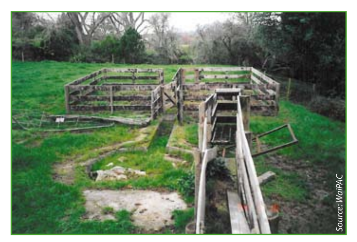
Race, yards and pot dip remains

significant soil and water contamination at most sites. Common practices for removing spent liquids and sludges from dips included gravity drainage to lower ground, pumping or bucketing liquid from the sump and shovelling of residual sludge onto a 'scooping mound'. The accumulation of contaminants from repeated dipping events during a season and year-to-year dipping operations produced highly contaminated soil around the discharge or dumping zone(s). Spent dip solution and sludge were often discharged into gullies, streams and the foreshore for ease of disposal. Storage of dipping chemicals or containers in barns or wool sheds may also have led to soil and water contamination.