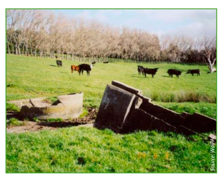
Outline of former plunge dip

Regional Councils are able to apply for Government funding to assist with the remediation of contaminated land, which will provide part of the costs if an application is successful.