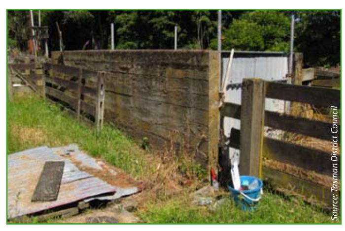
Rectangular shower dip with sump (under corrugated iron)

arsenic if they are collected from surface water downstream of a sheep dip or from a bore located within 300 metres of a sheep dip. Meat, eggs and vegetables raised on a sheep dip site are potential sources of human exposure to arsenic. Eating wildfoods (freshwater mussels, koura and watercress etc.) collected downstream from a sheep dip may also be a source of arsenic exposure. Mushrooms and edible plants (e.g. puha) or ferns should not be collected from the vicinity of a sheep dip.