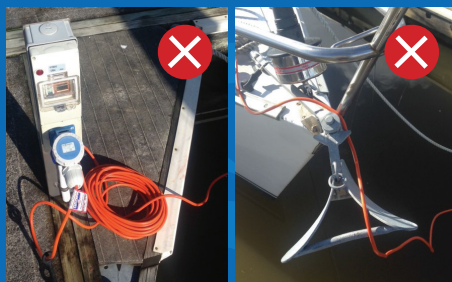
Do Not Coil Lead

Though the lead is tested and is part of the EWoF, it is usually the cause of most shore supply electrical faults. Because of movement, how the cable is laid and stored, the way it is plugged in and weather, are all major contributors to faults existing in your shore supply connection.