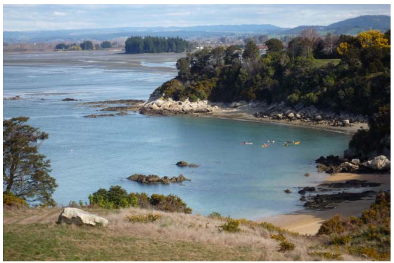
Stephens Bay, Kaiteriteri

• General upgrade works at Riwaka Rugby Grounds.