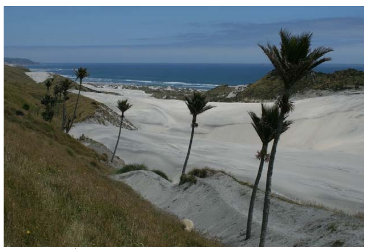
Turimawiwi sandhills, Golden Bay