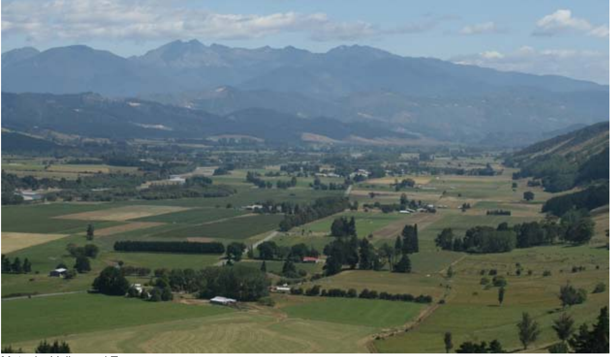
Motueka Valley and Tapawera

• New rising main for water pump station at Tapawera.