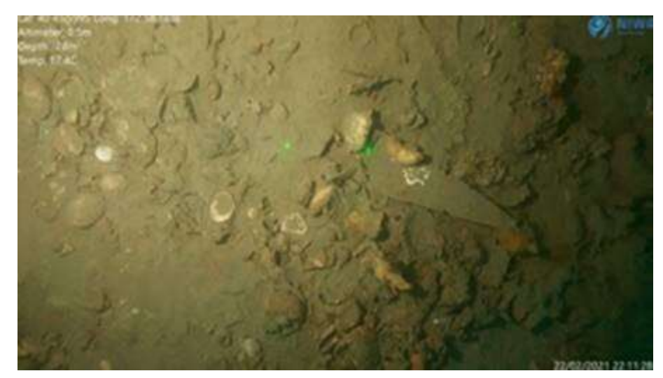
Dead carbonate material and ascidians (pale yellow) at site that previously supported bryozoan colonies (Hippomenella) (lasers are 10 cm apart);

under the umbrella of the Sustainable Seas National Science Challenge which is specifically looking at fine sediment impacts on the benthic environment.