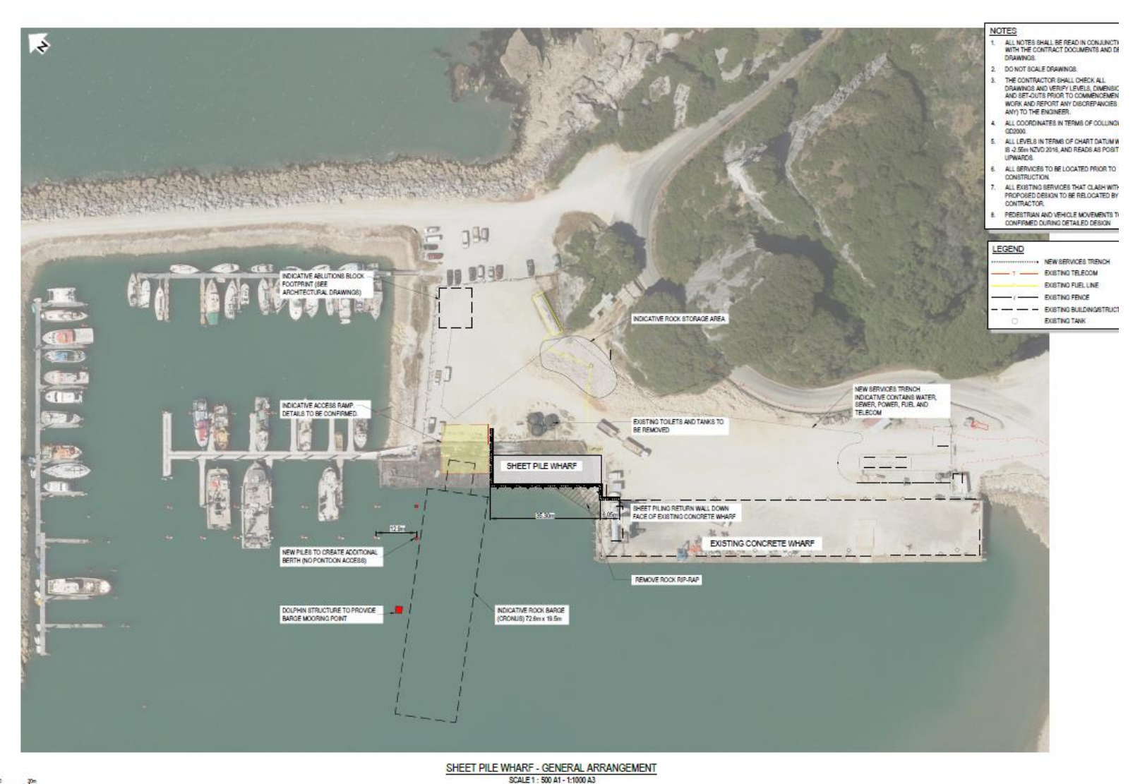
Figure 4 New wharf and ramp