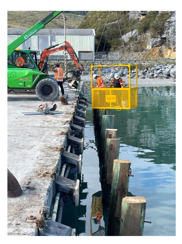
Figure 2 New fendering