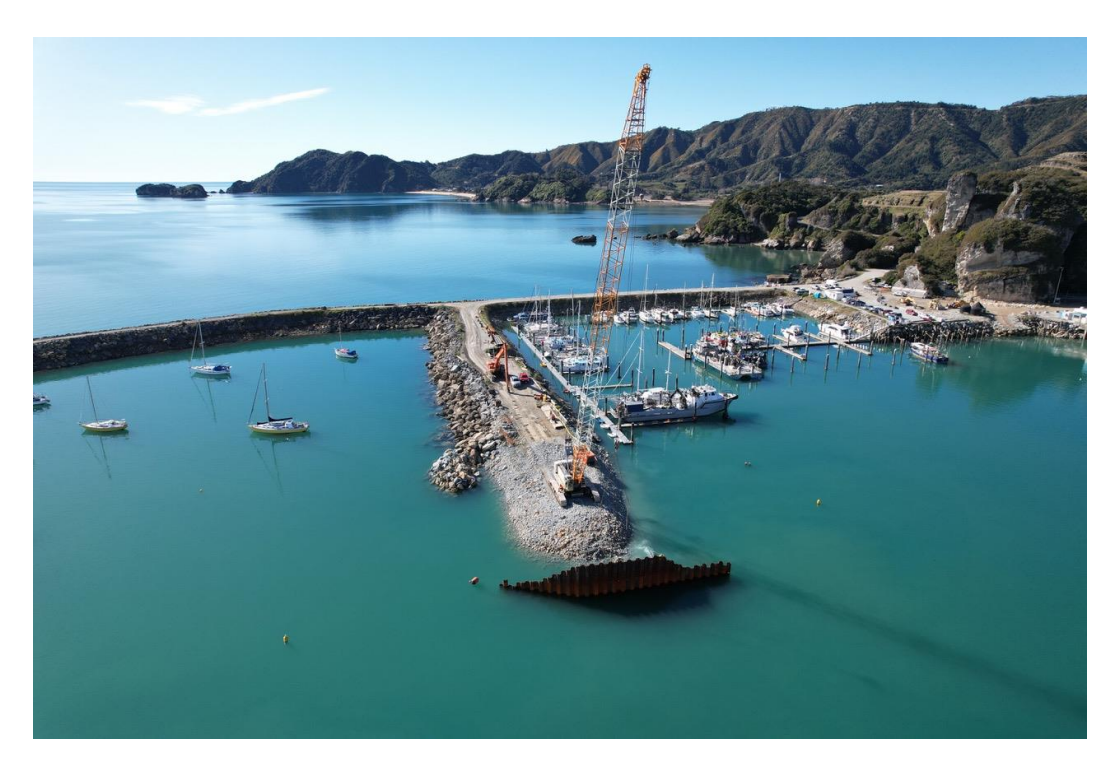
Figure 3. New berths