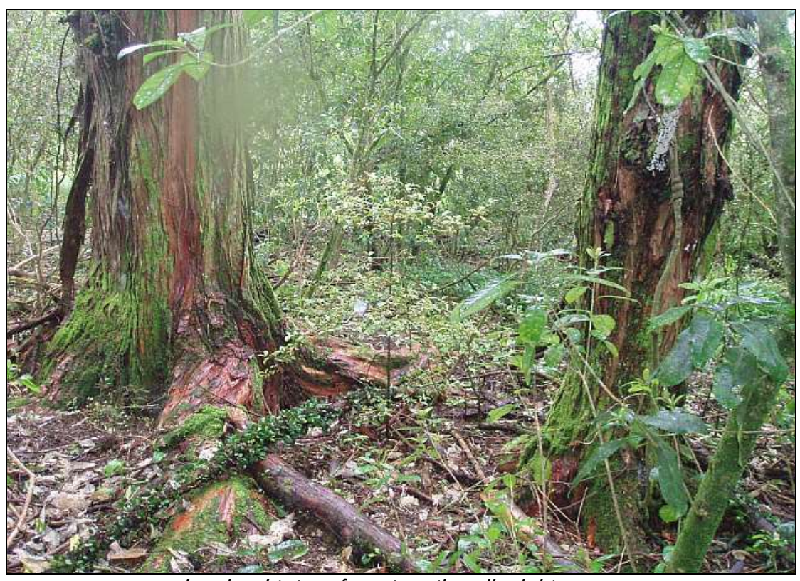
Lowland totara forest on the alluvial terrace