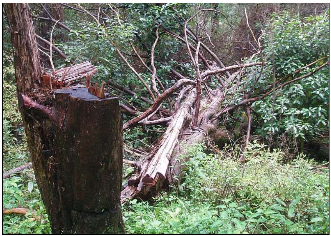
Yew control has been extensive, with this weed almost eliminated