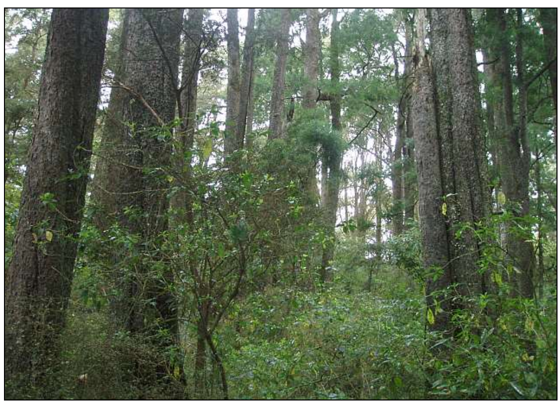
The western section of alluvial kahikatea forest is composed of tightly-packed trees and is, the best example of its kind in Motueka ED and in the Nelson Ecological Region