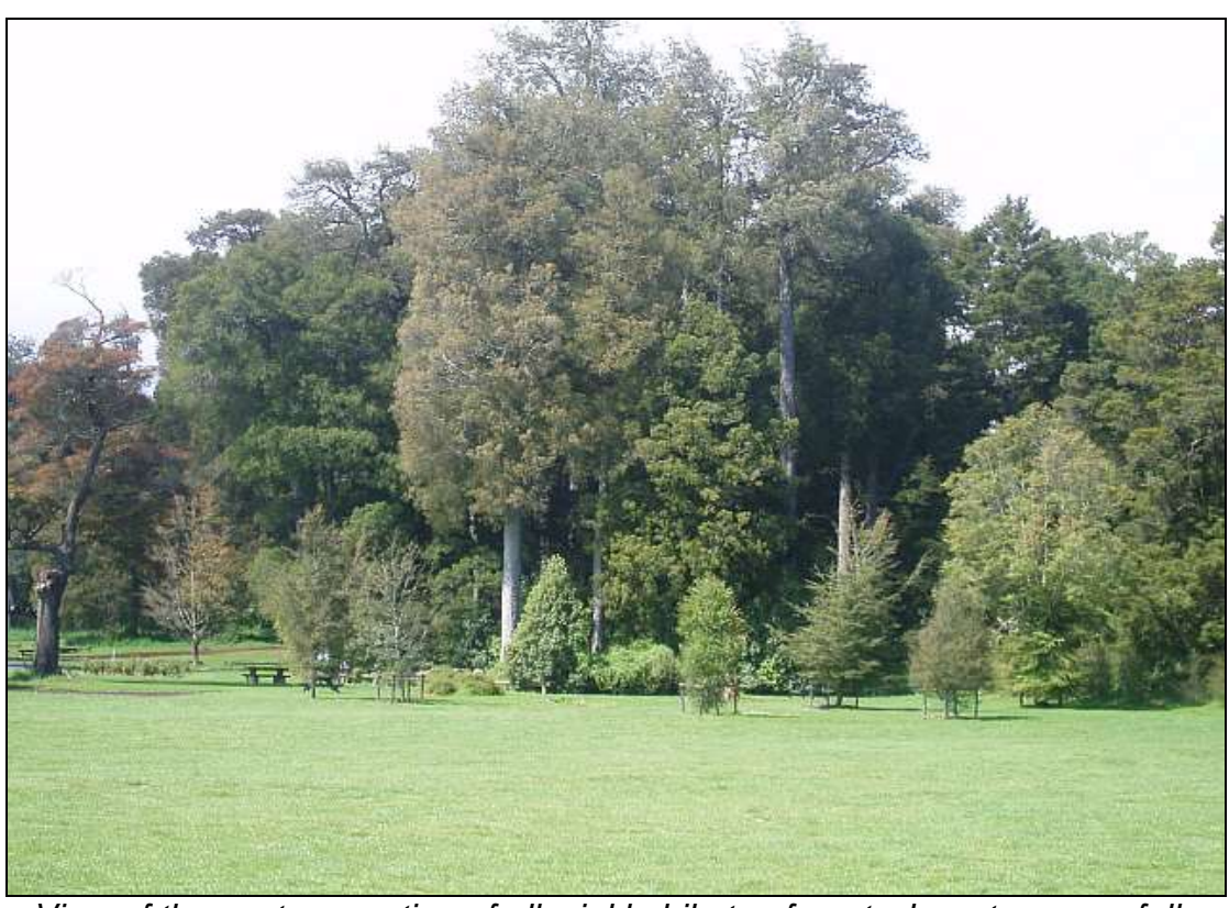
View of the eastern section of alluvial kahikatea forest where trees are fully mature