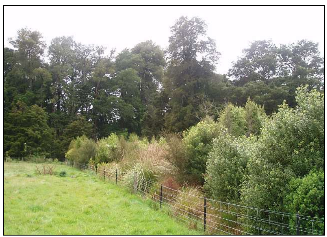
Restoration plantings are very extensive on the terrace and floodplain; this is the largest revetation effort of alluvial/terrace forest in the Nelson Ecological Region known to the author