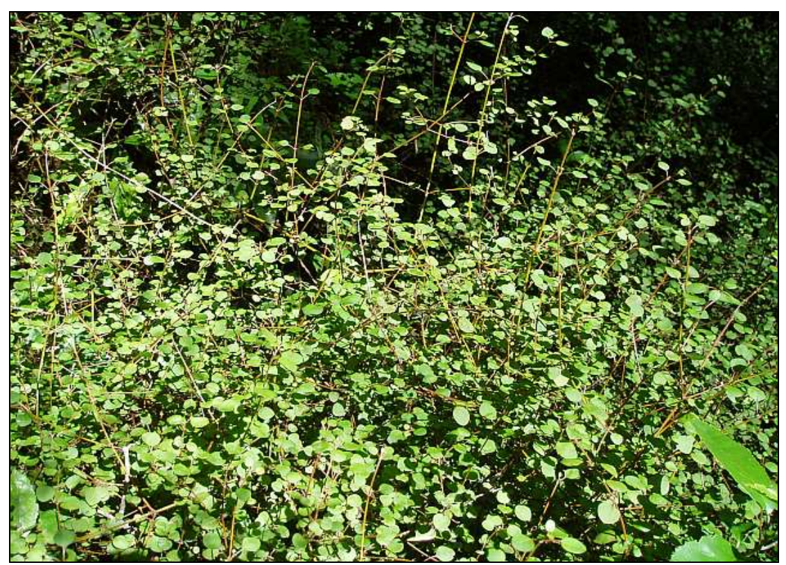
Native germander (nationally 'at risk – declining') occurs in the alluvial lowland totara forest, where there is an impressive stand – old man's beard is becoming well esablished only meters away