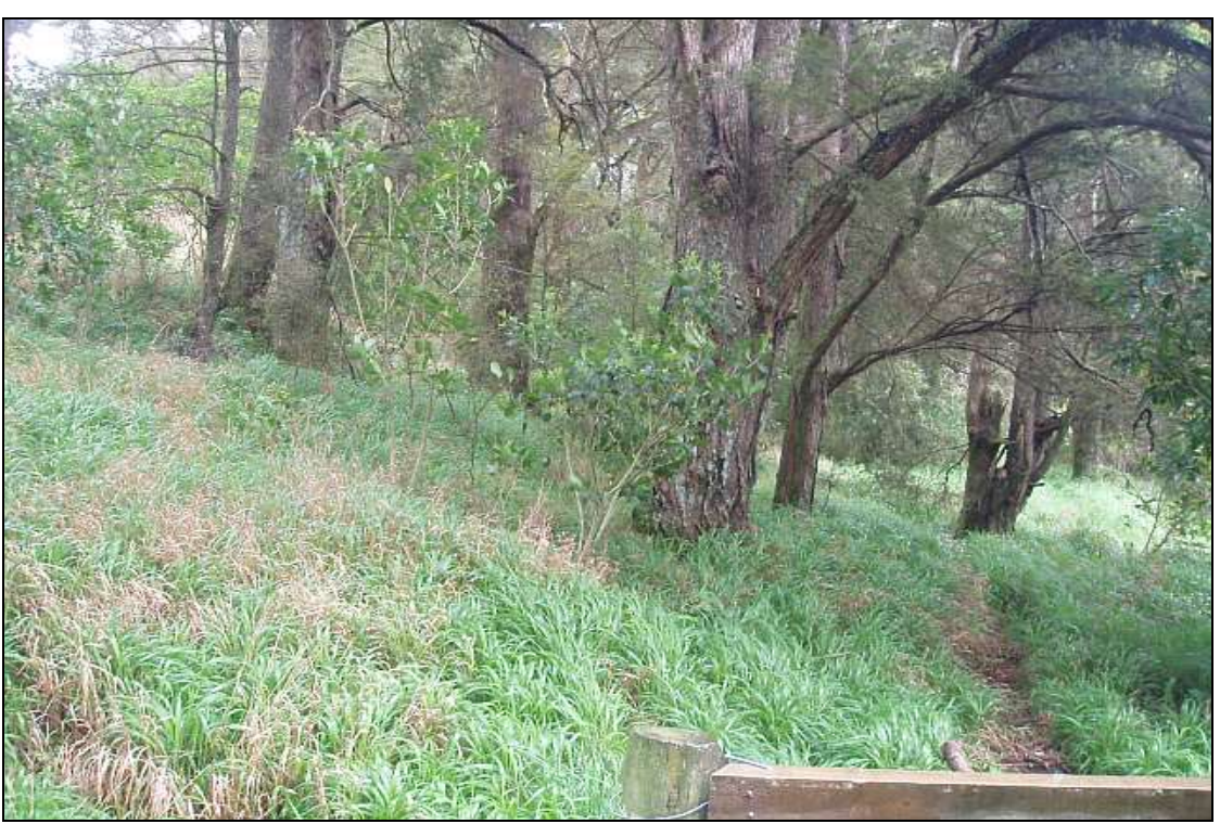
A weedy section of the lowland totara clad scarp slope, here lush with false brome; the free-draining nature of this slope makes native regeneration problematic in this middle section, not helped by the swarding exotic ground cover