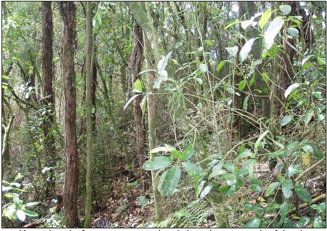
Young kanuka forest occurs as a band along the top margin of the site