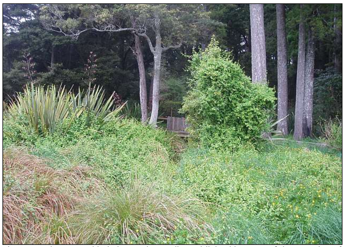
Japanese honeysuckle is becoming well established in parts of the margins of the western kahikatea stand; it is important to now focus on such weeds for the successful restoration of this site