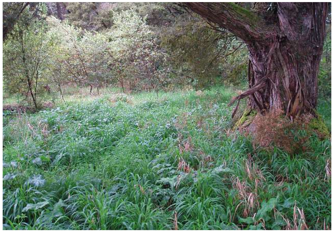
False brome and arum are abundant around the margins of the dry lowland totara terrace, where natural regeneration is struggling to get established; restoration plantings are visible to the left