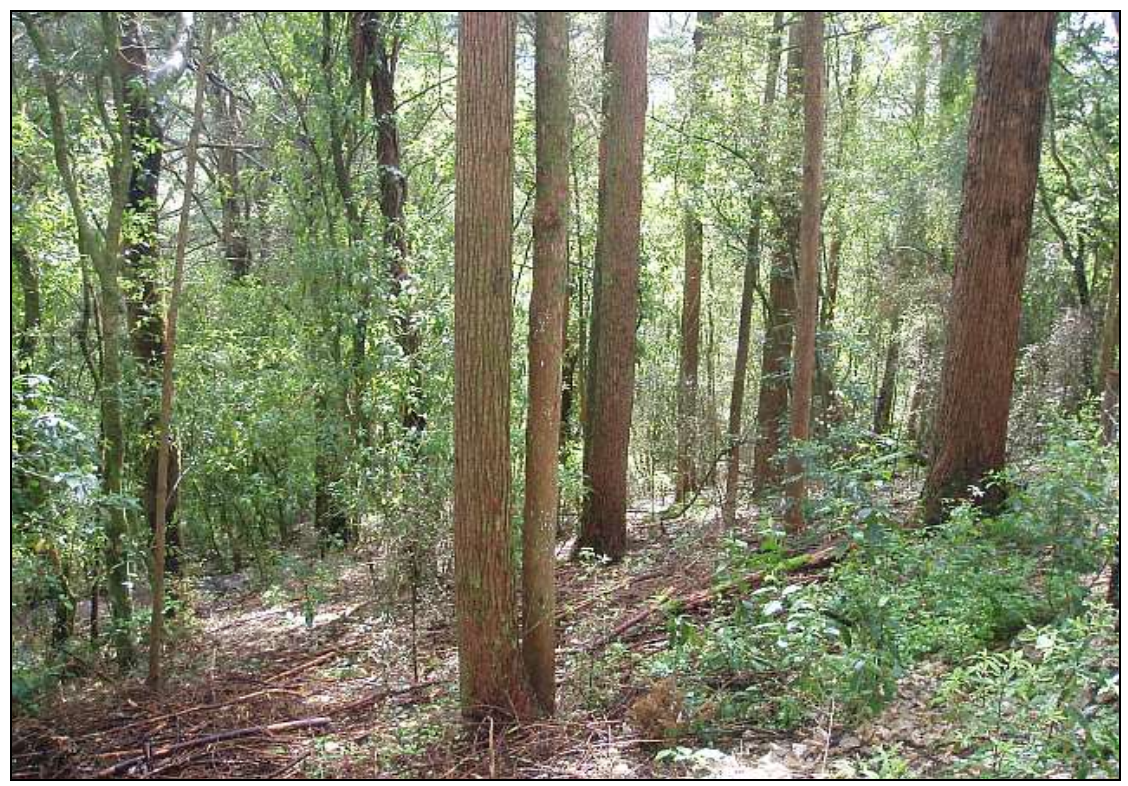
Secondary lowland totara forest on the hill-slope above the terrace and floodplain