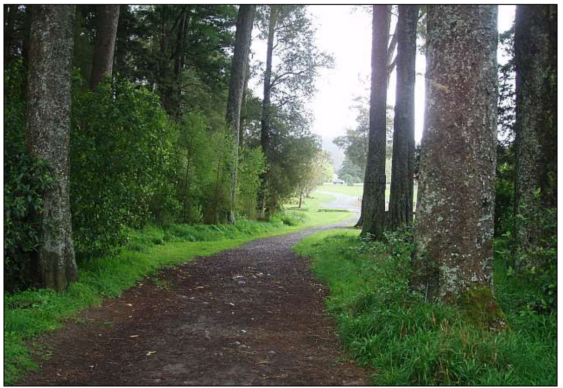
The eastern section of kahikatea forest includes many impressive trees, but this part is highly modified with exotic grasses and a wide track running through it