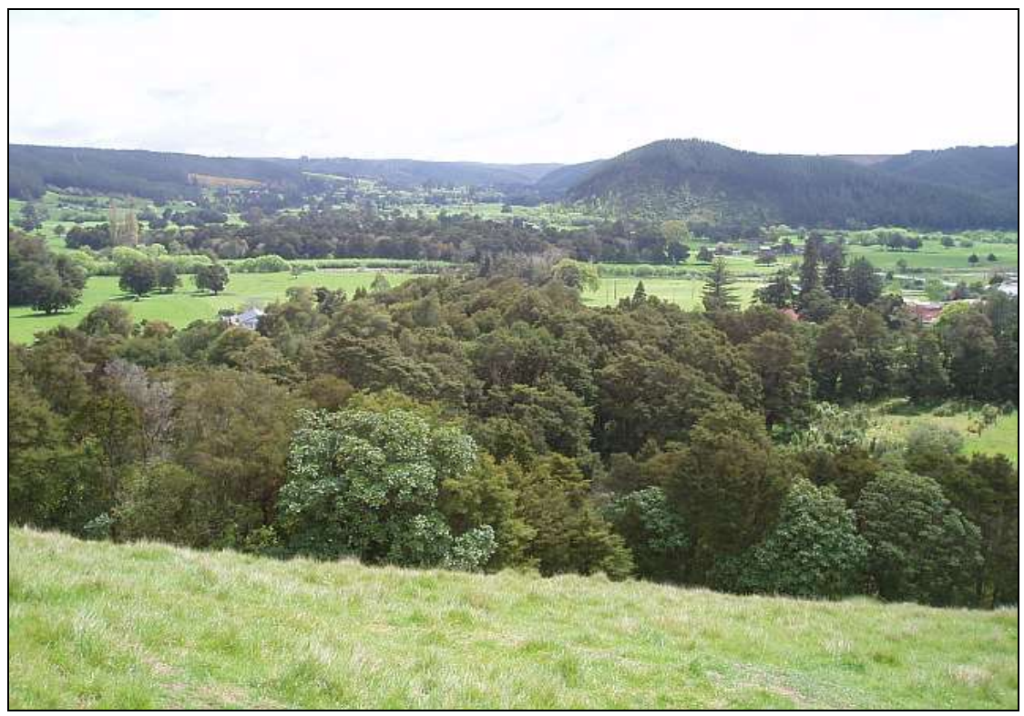
Faulkner Bush from above looking across to the privately owned Baigent Bush