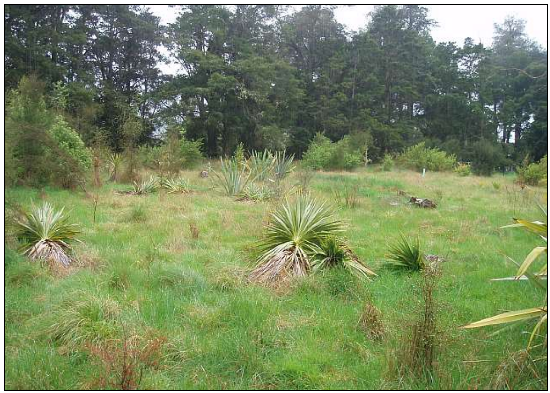
A small proportion of the replanting has struggled to get established, probably where soil moisture is naturally low; it is certainly not helped here with such vandalism (cabbage trees felled)