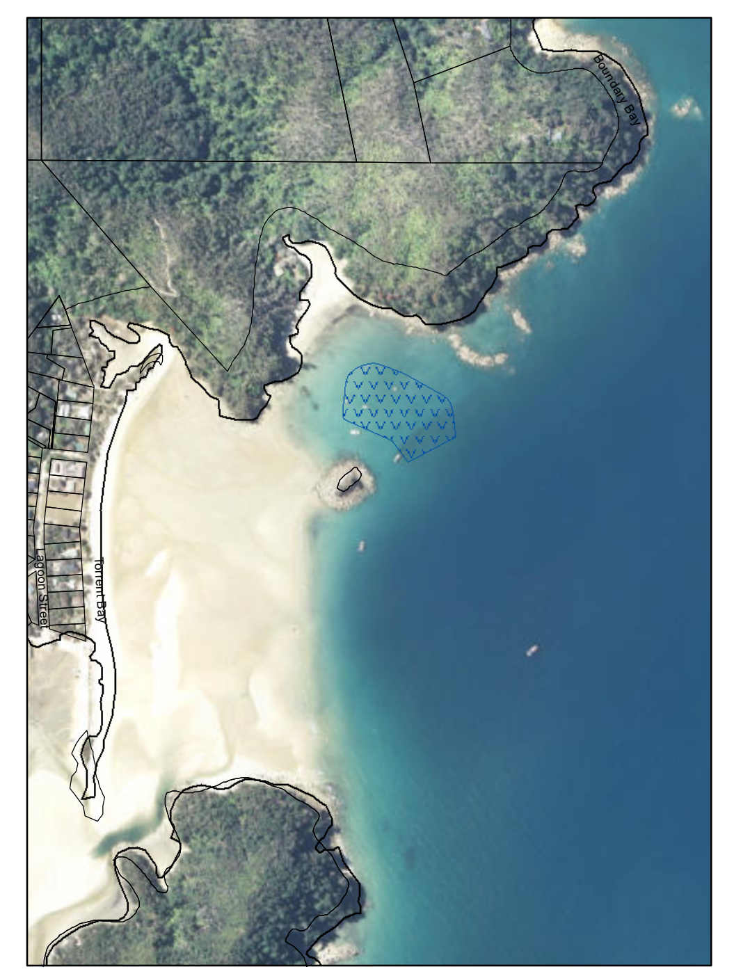
Map 180H: Glasgows and Torrent Bays