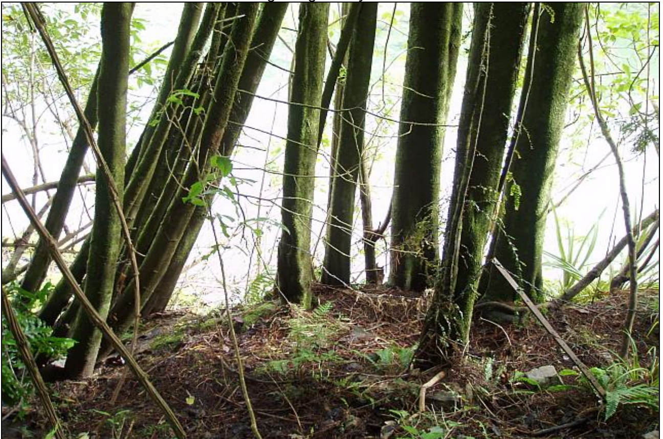
A tight cluster of kahikatea with flood impacts evident