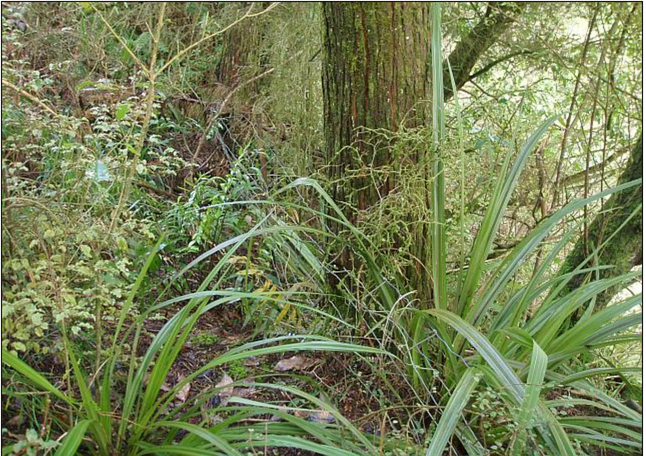
Typical interior with much Astelia fragrans and mapou regeneration; the fence netting is a relic of former grazing activity in the area