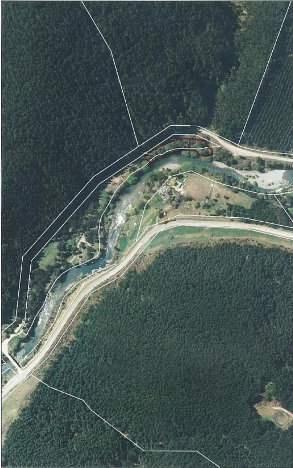
Top of the South Maps B 88 Meads Recreation Reserve