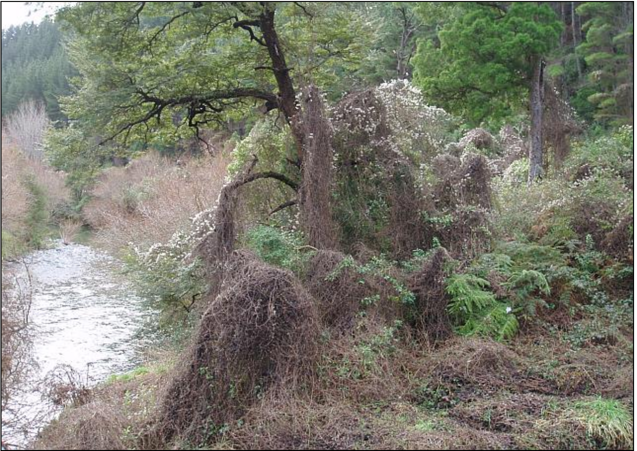
The upstream end of the area of native forest, illustrating the heavy impacts of old man's beard on the site