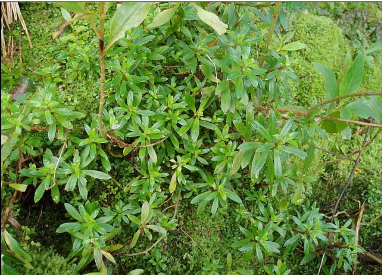
Anaphalis trinervia , a native daisy, is one of the turf species present