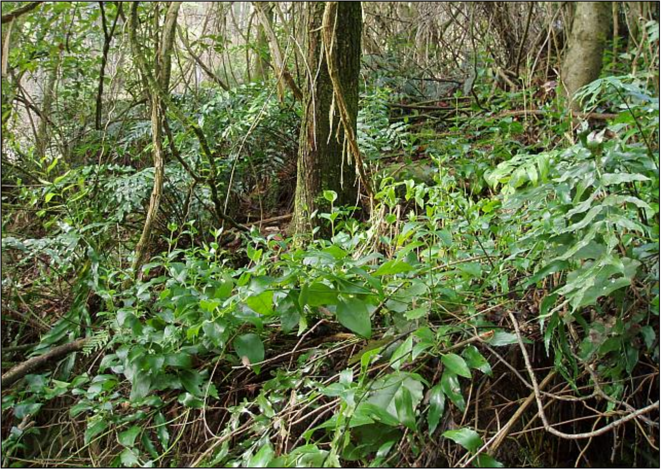
A patch of periwinkle is present