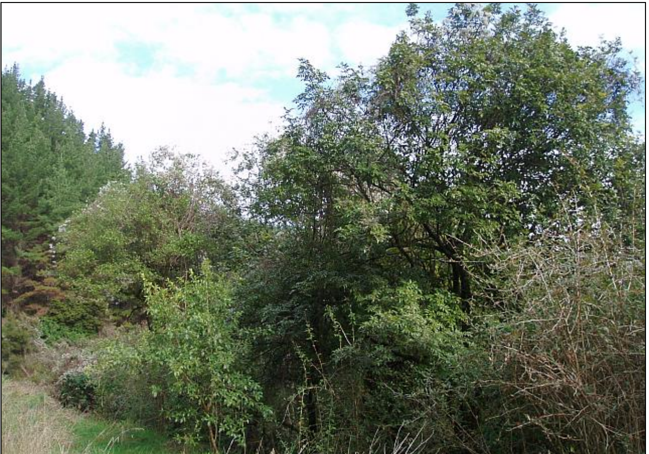
Titoki along the road margins