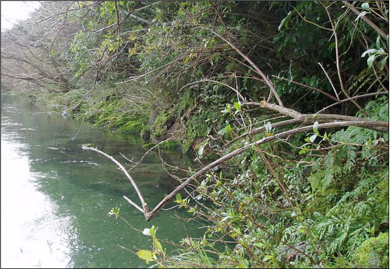
Riparian shrublands of tutu and dense turfs hugging the banks