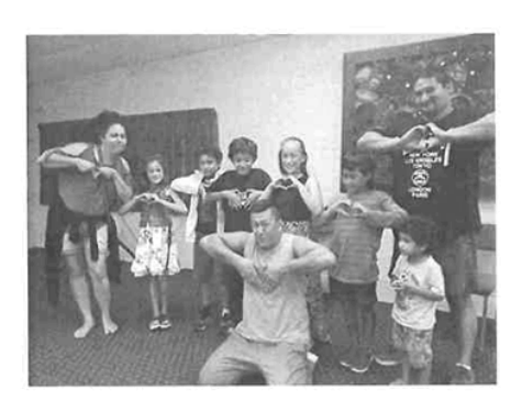
Hinemihi Marae, Rotorua - Parents are bringing their kids.