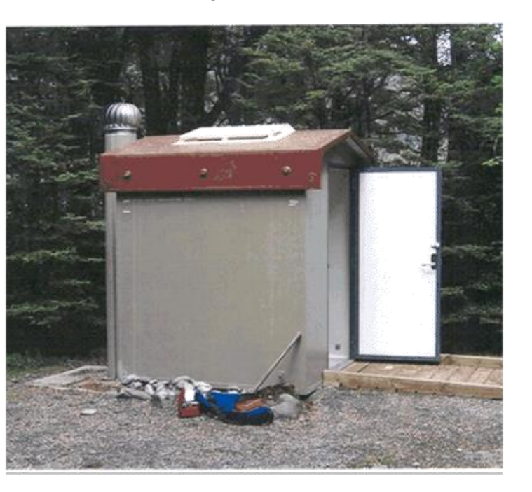
Old longdrop toilets behind pump station