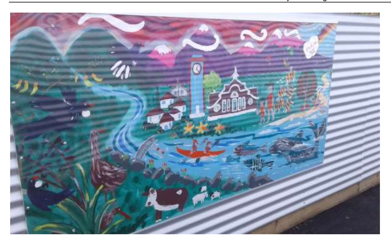
MOTUEKA RUDOLF STEINER CLASS 4 AND 5 - ART PANEL