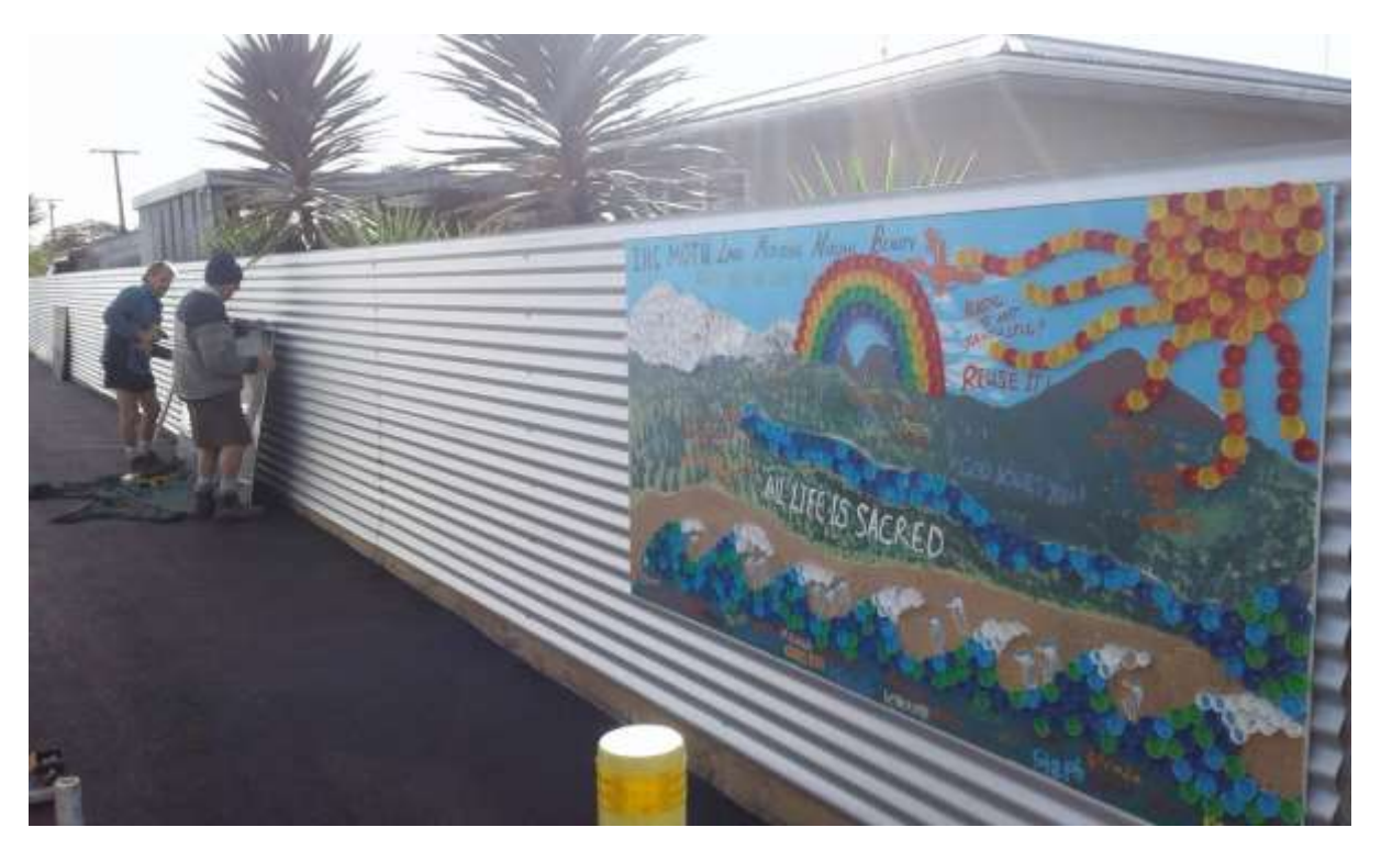
VOLUNTEERS INSTALLING ART PANELS – IHC MOTU ART PANEL