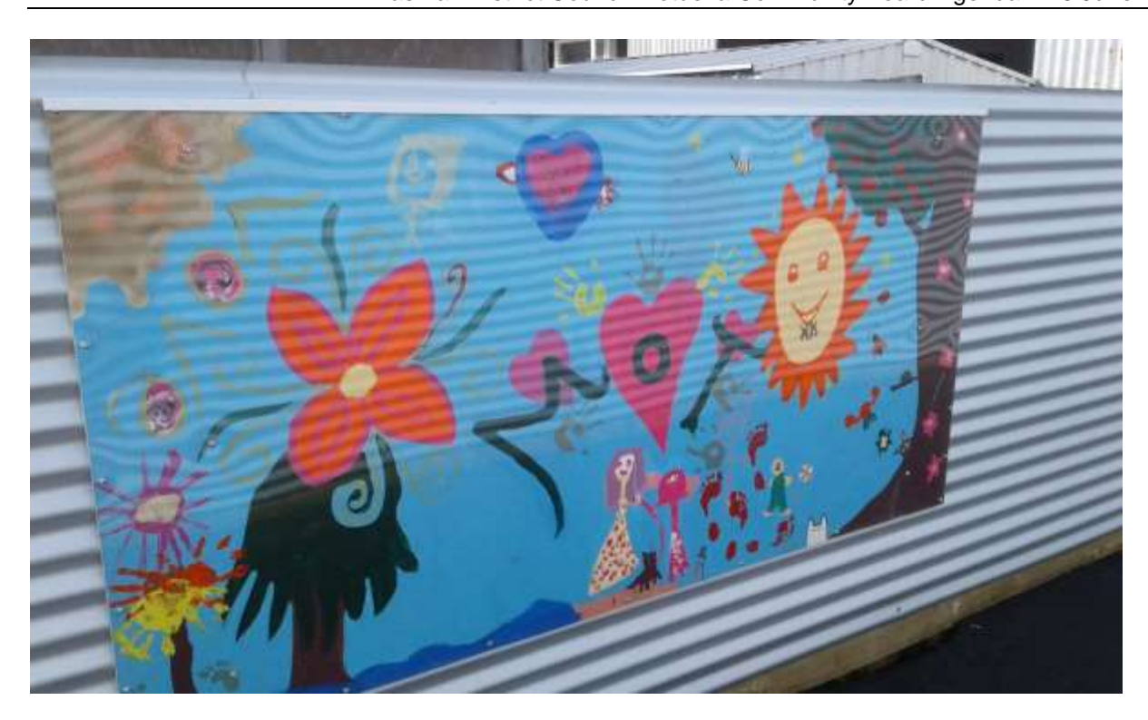
WOODLAND AVENUE CHILDREN ART PANEL #1