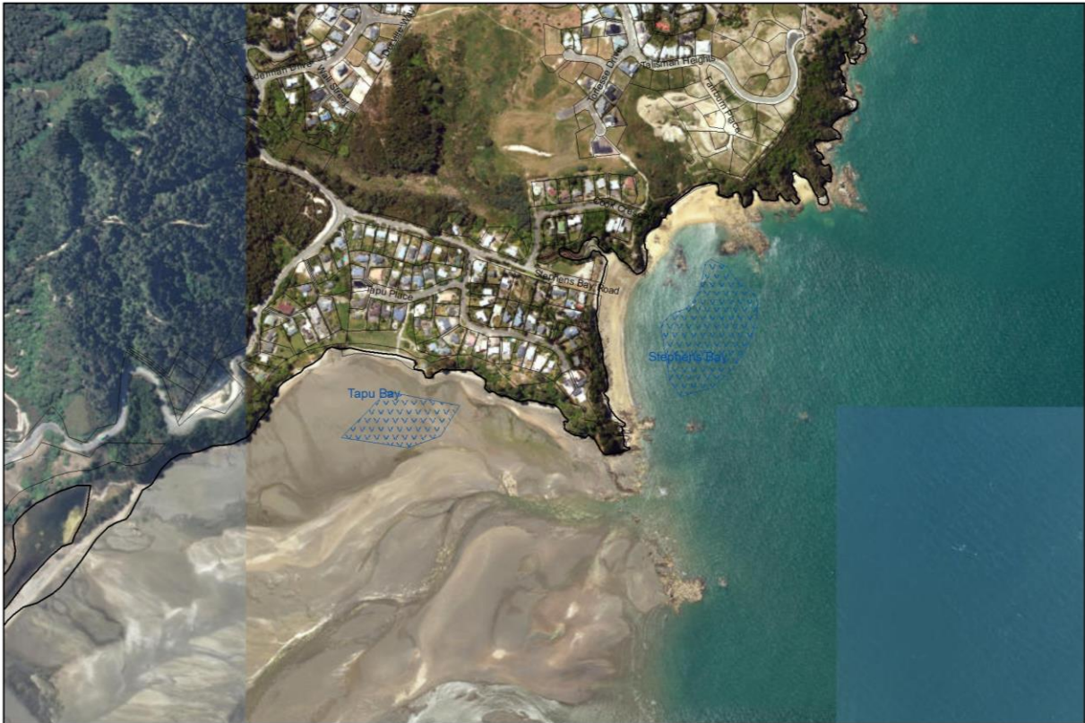
Map 180C: Tapu Bay - Stephens Bay