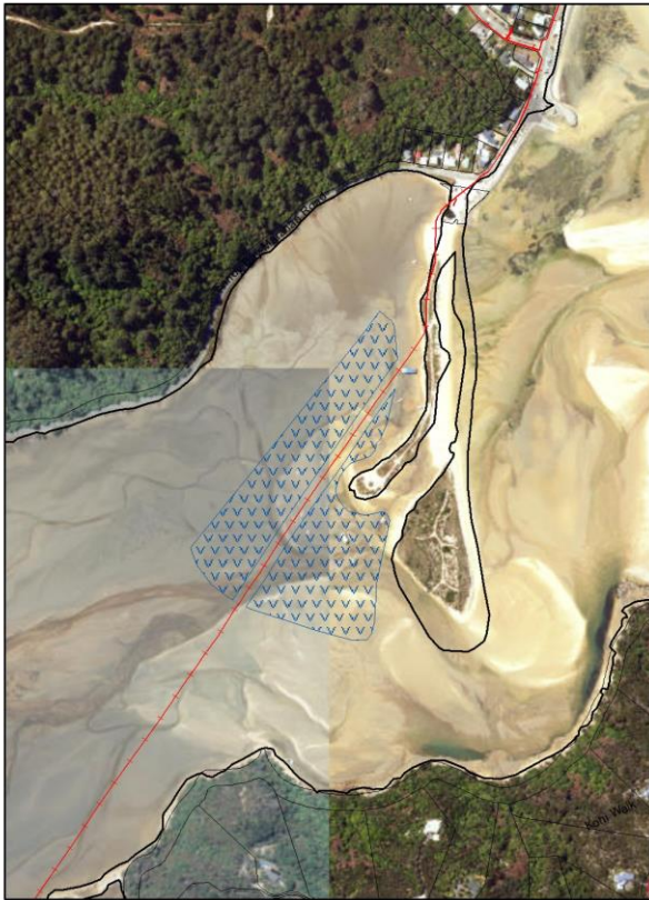
Map 180G: Otuwhero Inlet - Marahau