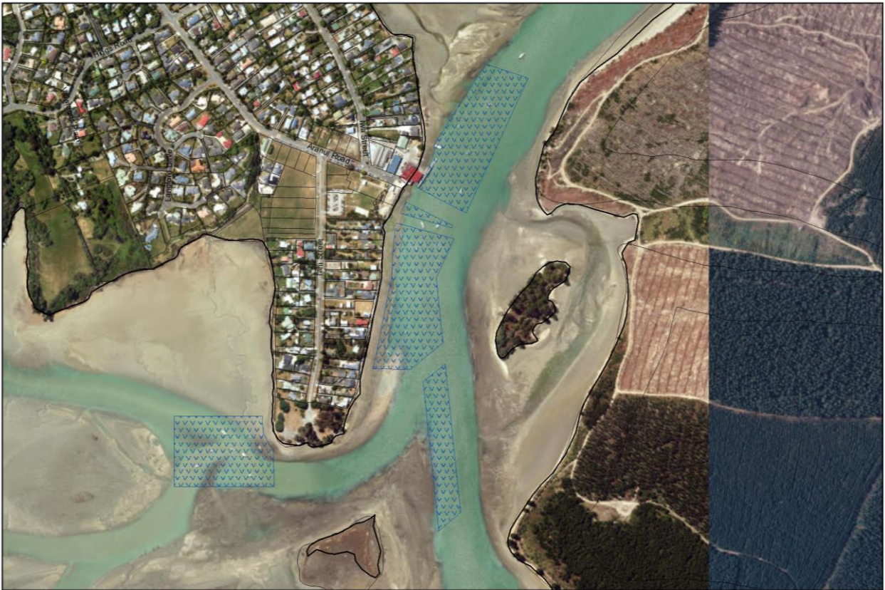
Map 180A: Mapua