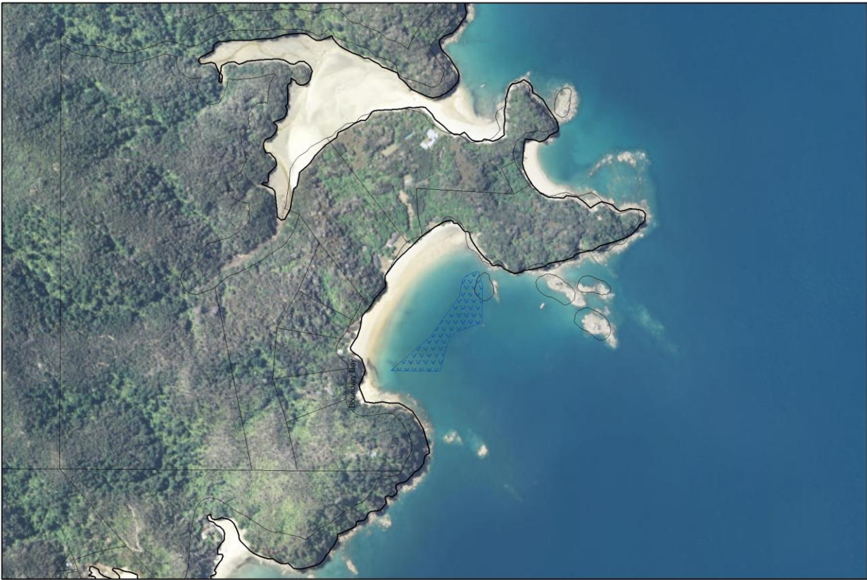
Map 180E: Boundary Bay