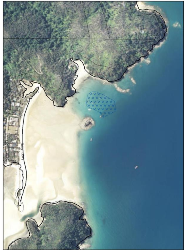
Map 180H: Glasgows and Torrent Bays