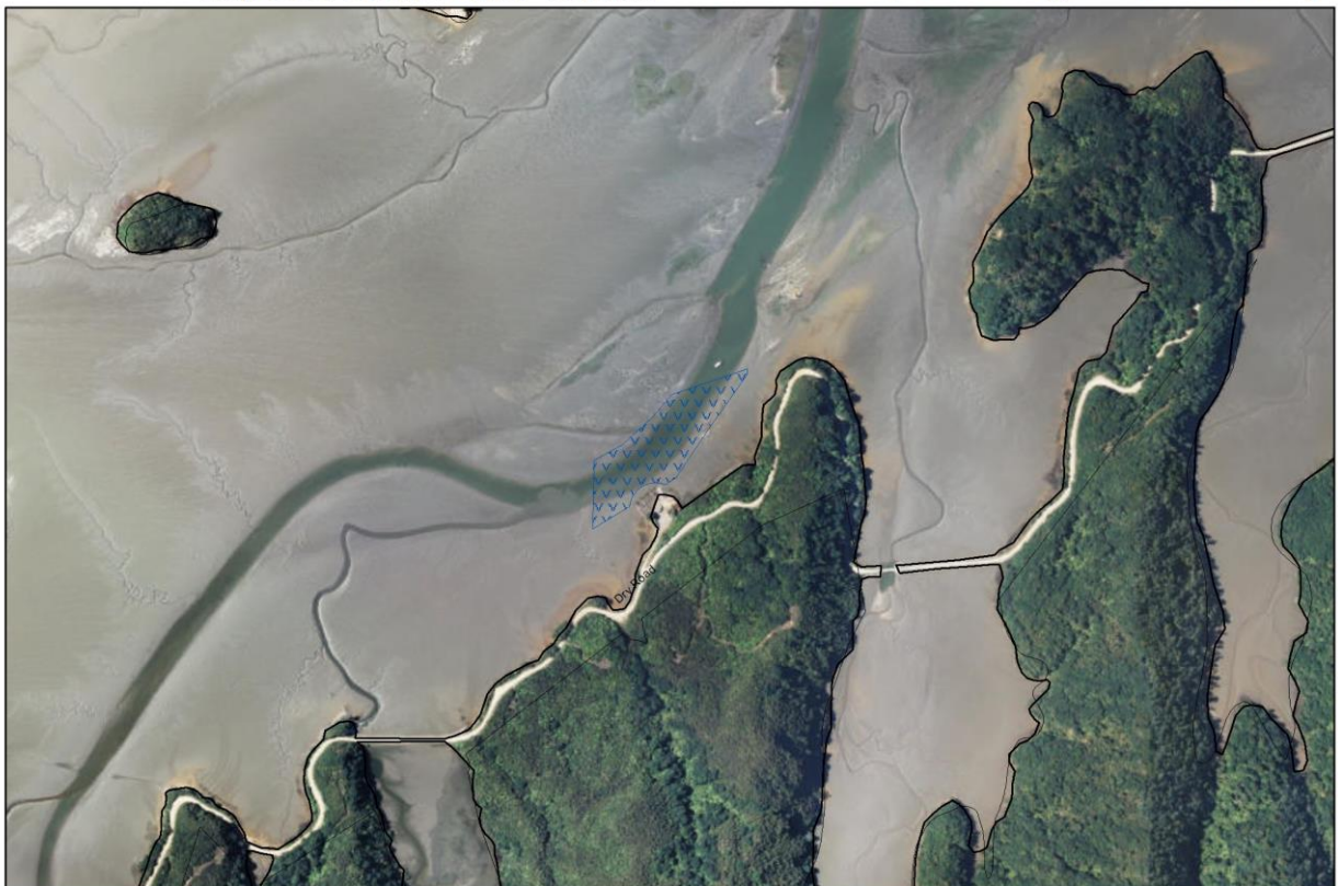
Map 180I: Mangarakau Wharf Mooring Areas Update Map 64/8 20 June 2020 Map affected: 180