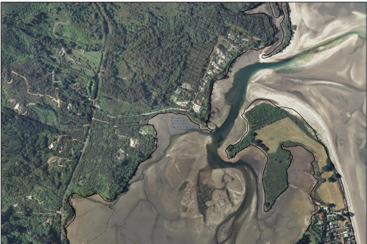
Map 180F: Milnthorpe