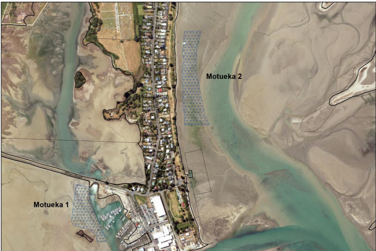
Map 180B: Motueka Mooring Areas Update Map 64/5 20 June 2020 Map affected: 180