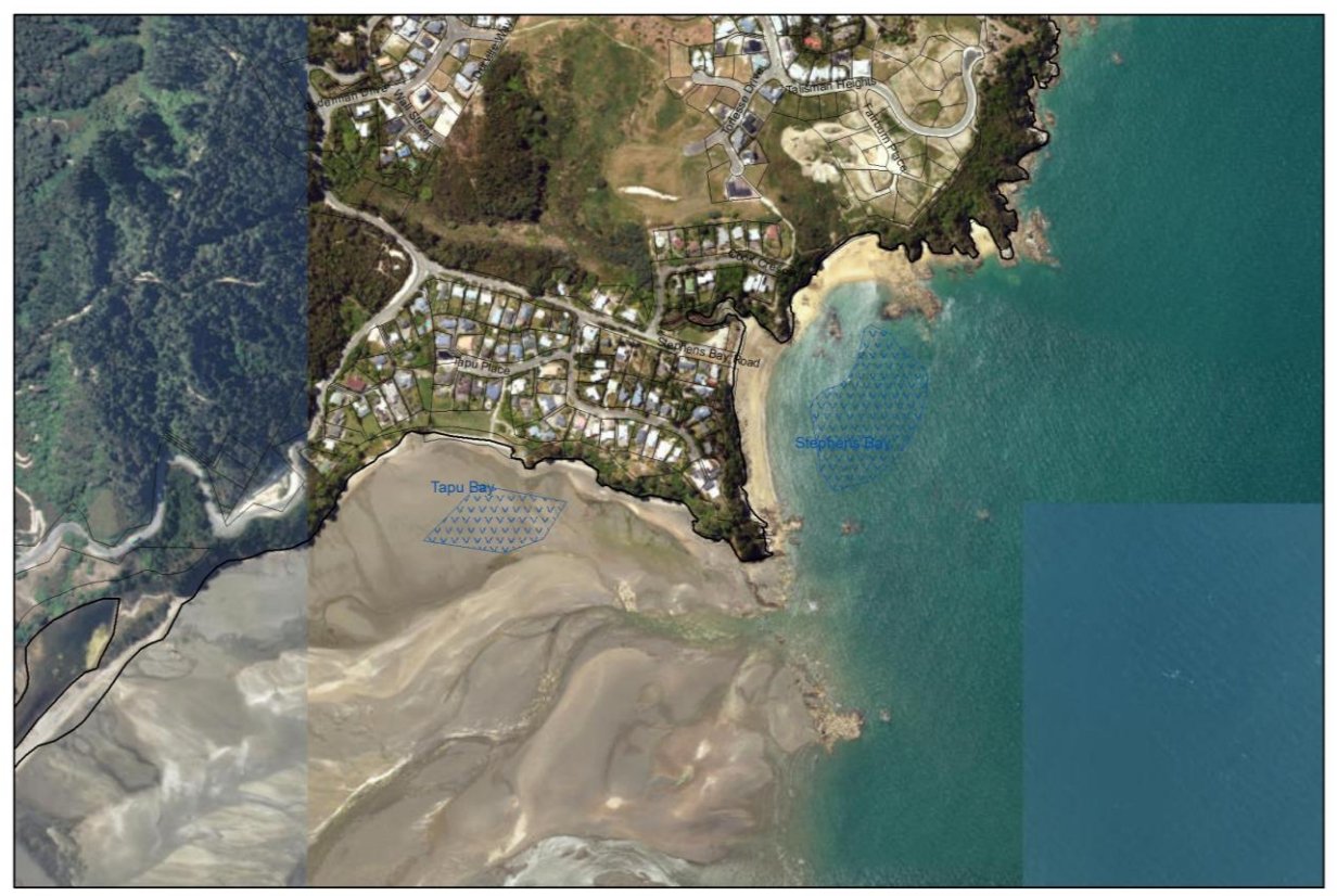
Map 180C: Tapu Bay - Stephens Bay