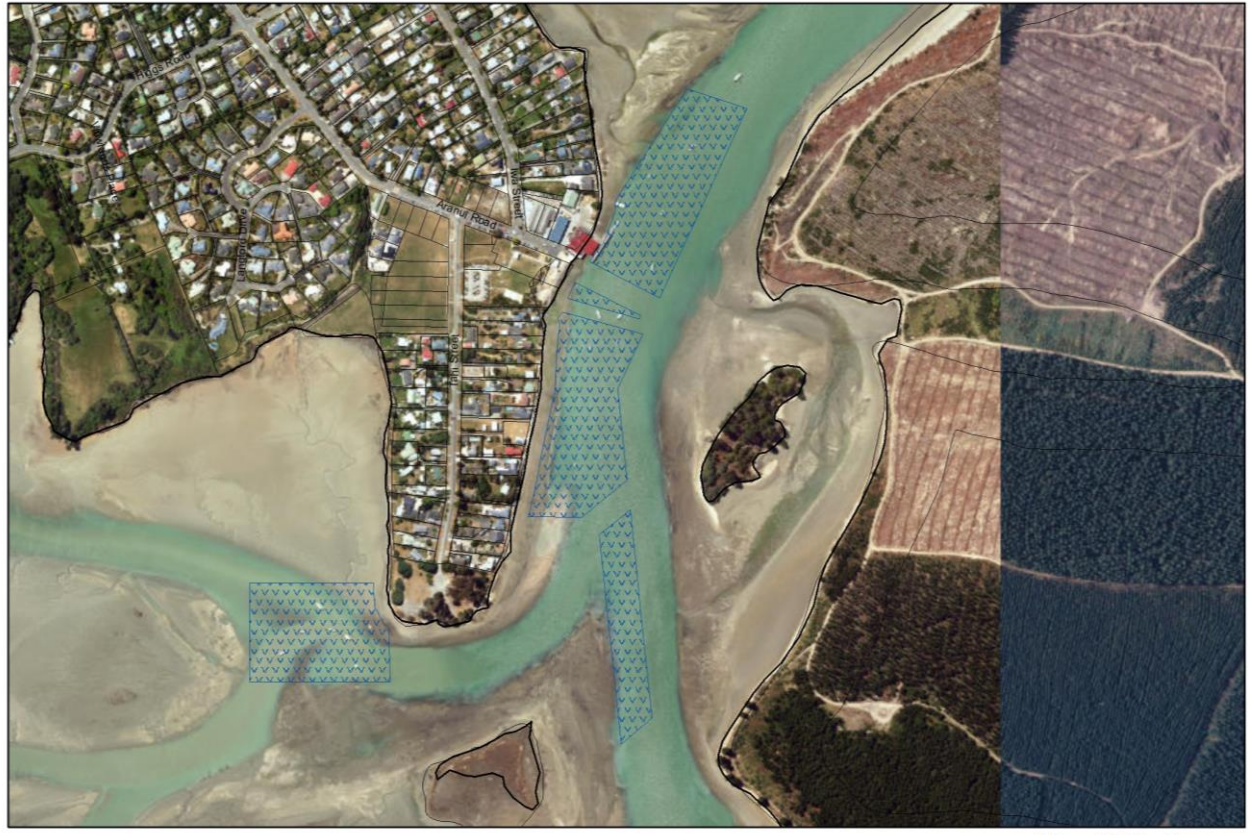
Map 180A: Mapua