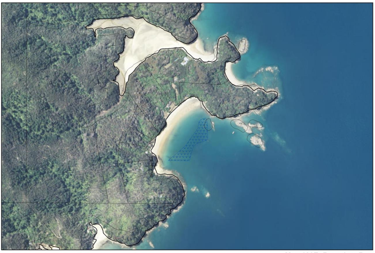
Map 180E: Boundary Bay