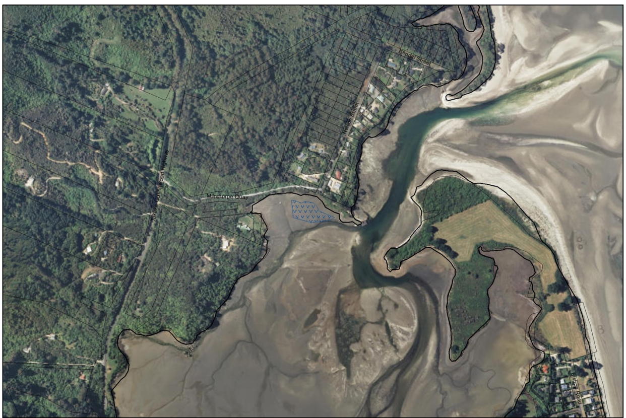
tasman district council

TASMAN RESOURCE MANAGEMENT PLAN Plan Change 72