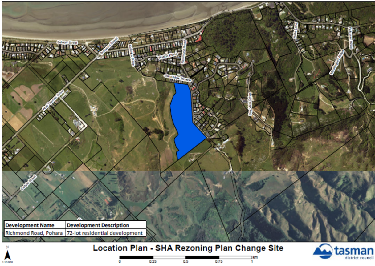
Figure 2: Location Plan of the SHA site at Pohara