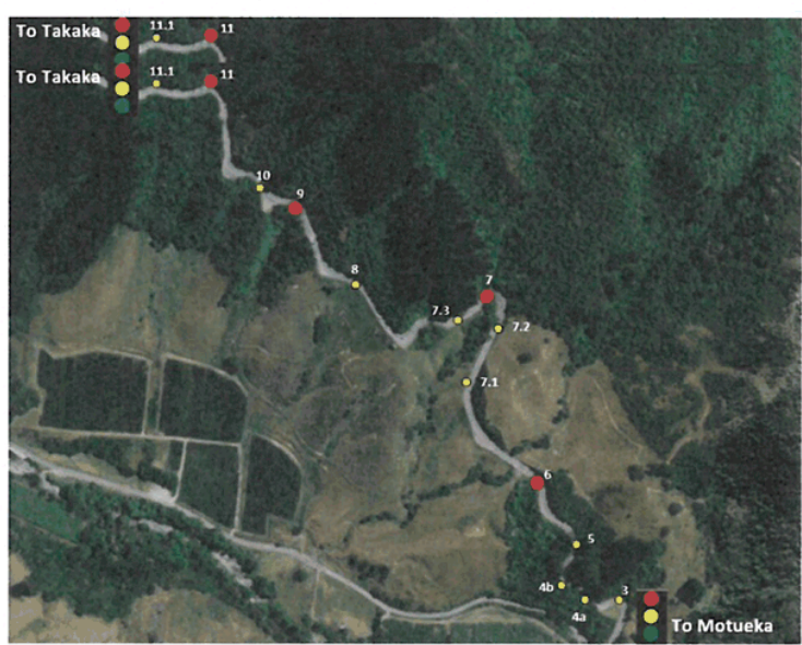
Map showing location of minor sites (yellow) and major sites (red)

The NZ Transport Agency's Tasman Journeys' team has made great progress on the 10 minor slip sites on Takaka Hill, with work at these sites nearing completion. Construction at the five more significantly damaged sites is due to start soon. Engineering consultants Beca, commissioned by the Transport Agency, have been designing the repairs to these sites in recent months. These will include reinstating the road using reinforced earth retaining walls and rock filled facing.