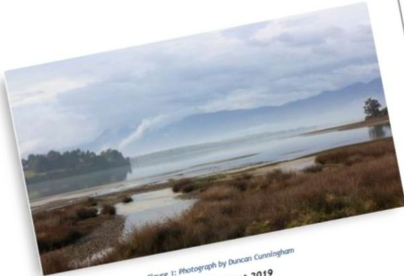
Figure 1: Updated August 2019