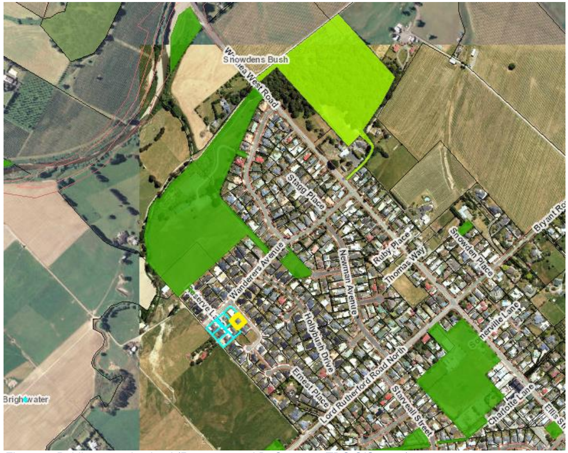
Figure 3: Public recreation land (Reserves and DoC estate, TDC GIS 2018)