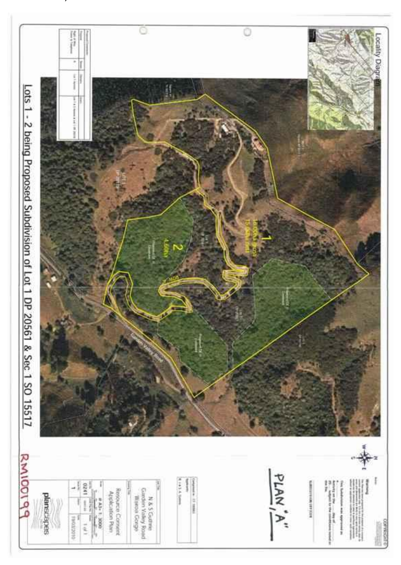
PLAN A, RM100199 - Scheme Plan