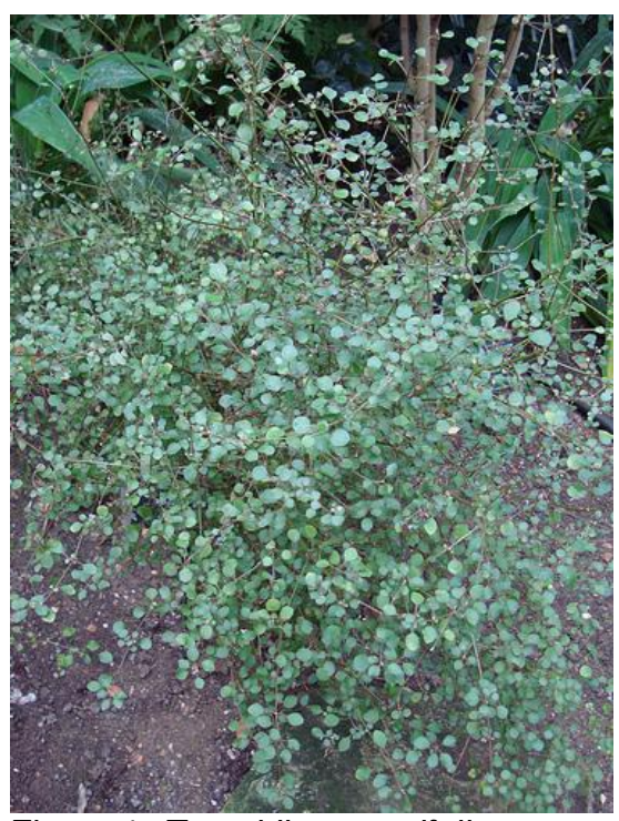
Figure 1: Teucridium parvifolium

Mr McFadden introduced the application and said that the applicant has volunteered a condition for a large block of podocarp forest, containing the rare plant Teucridium parvifolium (Figure 1), to be subject to a QEII covenant.