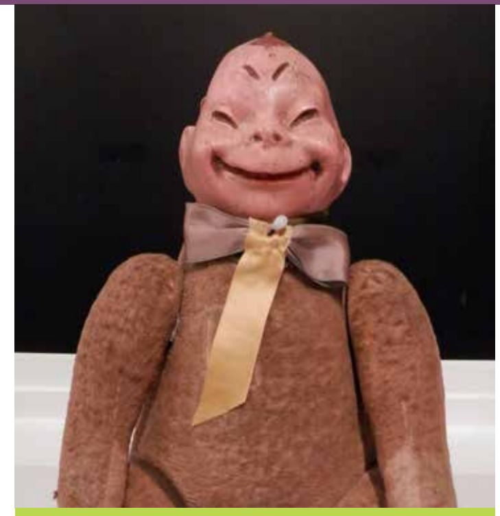
A Billiken Doll from the early 1900s. The dolls originated from the United States and came with the promise of 99 years of good luck. Hundreds of thousands of the dolls were sold in the early part of the century.

animals to musical instruments to children's tin toys, photographs and Maori taonga.