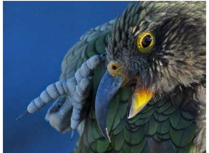
Overall winner, Scratching Kea , by Rudolf Mosimann.

More than 300 of the photos can be viewed at the Motueka Museum and Muses cafe until the end of July 2010.