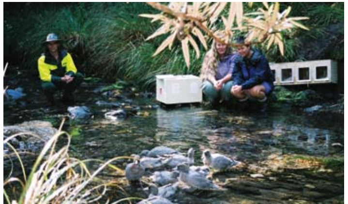
A DoC ranger and Friends of Flora volunteers release whio into the wild.

A healthy 116 nominations were received from Nelson-Tasman for the TrustPower awards this year. Supreme winner was the Nelson-based Save (Students Against Violence Everywhere) group. The Tasman District winner was the Mapua Community Library.