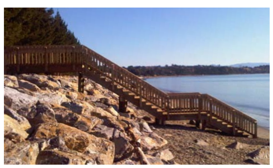
Holding the sea at bay.