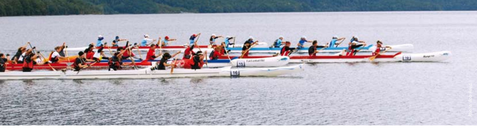
Women's and mixed crews race at the Tuna e Hoe Ana regatta last year.