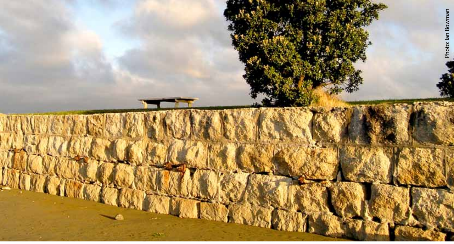
Old Stone Wharf – Motueka Quay.