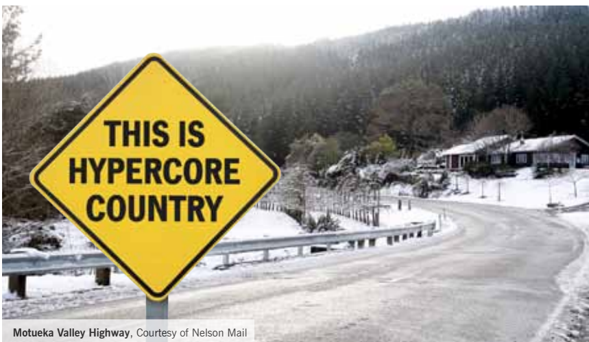
Motueka Valley Highway