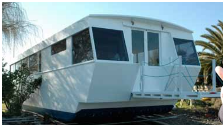
The Mapua - Rabbit Island Ferry prior to launch.

The ferry will have its official opening on Sunday 2 October 2011 and will be operating to take visitors and their bikes across the estuary. The opening coincides with the completion of the cycle trail through Rabbit Island making the day the perfect opportunity for individuals and families to get their bikes out and take in the latest, and most unique, cycle trails in New Zealand.