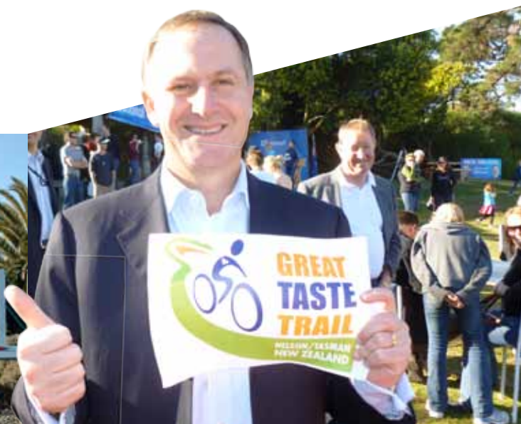
John Key gives Tasman's Great Taste Trail the seal of approval.