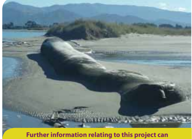
Further information relating to this project can be found on the Council website at www.tasman.govt.nz/link/jackett-island

The Council was also ordered by the Court to remove the full length of the groyne on the spit. Resource consent was issued in March 2012, which stipulated that the groyne had to be removed between May and August 2012. This work is expected to begin soon and should take approximately six weeks. Members of the public are asked to please keep the work site clear.