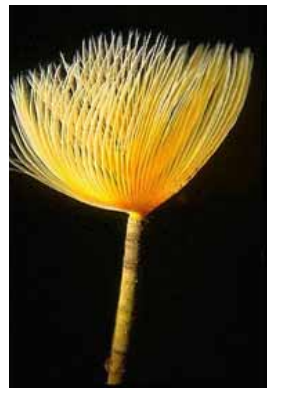
Mediterranean fan worm