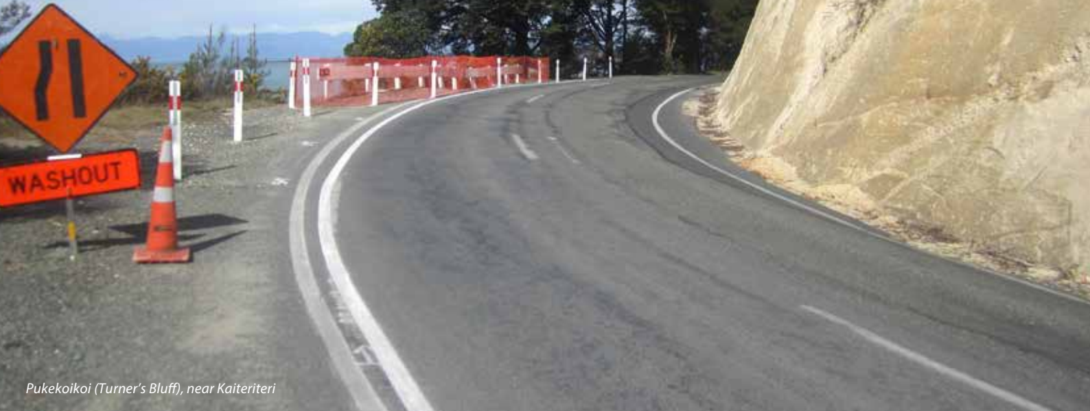
Pukekoikoi (Turner's Bluff), near Kaiteriteri

Keeping you informed about news and events in Tasman District