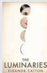
The Luminaries by Eleanor Catton