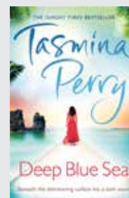
Deep Blue Sea by Tasmina Perry

Check our new site out for yourself at www.tasmanlibraries.govt.nz