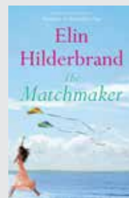
The Matchmaker by Elin Hilderbrand

Check our website out for yourself at www.tasmanlibraries.govt.nz