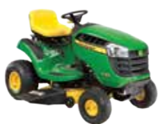
D105 17.5hp Briggs & Stratton engine, Automatic trans, 42" deck.