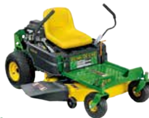
Z235 20hp, V-Twin, Hydro-Gear trans, 42" deck.