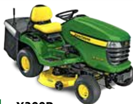
X300R 18.5hp engine, K46 Automatic trans, 42" Deck, Rear catcher.