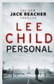
Personal by Lee Child