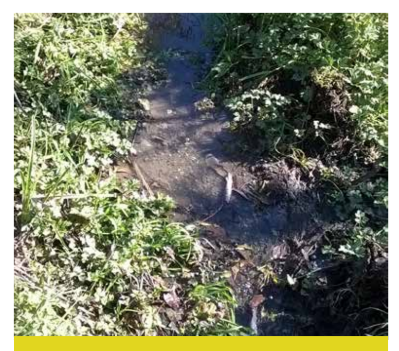
A freshwater stream containing dead fish affected by cleaning chemicals.

If you are using cleaning products on your house, roof or driveway, it is important to ensure these chemicals are not going down any stormwater drains via guttering or grates on properties or nearby roads. If the product mentions 'keep out of reach of children' and 'avoid skin contact' then it is not good in our waterways. Please carefully follow the manufacturer's instructions and divert washwater, or the next rain, away from drains and out onto grassed or landscaped areas. Reducing the amount of harmful run-off is an essential part of ensuring the environment is not affected permanently and that we have whitebait and other life in creeks, streams and estuaries for the future.