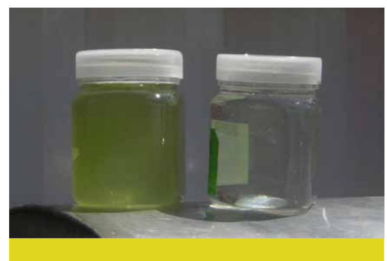
Wastewater samples before and after membrane filtration

The Council and iwi are seeking feedback on the treatment solution.