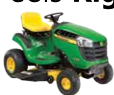
D105 17.5hp ^ Briggs & Stratton engine, Automatic trans, 42" deck.