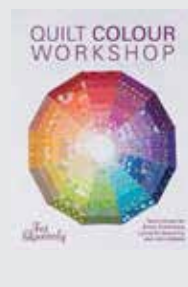
Quilt Colour Workshop by Tacha Bruecher