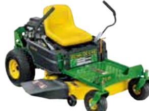
Z235 20hp ^ , V-Twin, Hydro-Gear trans, 42" deck.

^ The engine horsepower and torque information are provided by the engine manufacturer to be used for comparison purposes only. Actual operating horsepower and torque will be less. Refer to the engine manufacturer's web site for additional information.