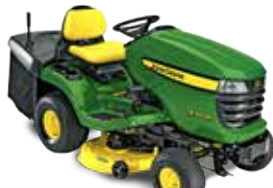
X300R 18.5hp ^ engine, K46 Automatic trans, 42" Deck, Rear catcher.