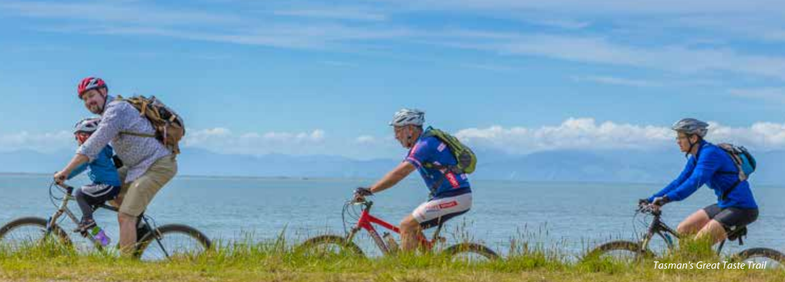
Tasman's Great Taste Trail

Keeping you informed about news and events in Tasman District