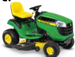
D125 - ALL NEW! 20hp ^ engine, Hydrostatic trans, 42" deck.