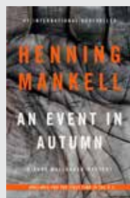
An Event In Autumn by Henning Mankell