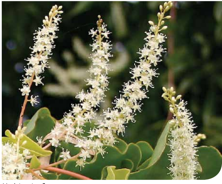
Madeira vine flowers

As this vine is known only in a few locations throughout the district, it is targeted for eradication. If you know of this plant on your property or have seen it elsewhere, please contact a Biosecurity Officer at Tasman District Council on Ph. 03 543 8400, who will advise on, and assist with, its control.