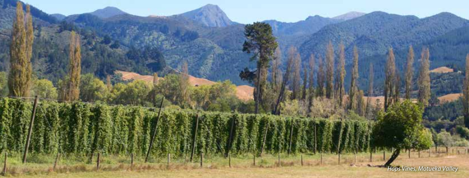
Hops Vines, Motueka Valley

Keeping you informed about news and events in Tasman District