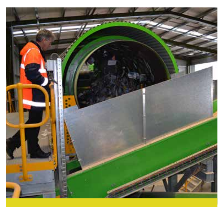
Mayor Kempthorne viewing the new centre

This is the fifth materials recovery facility that Smart Environmental has opened in New Zealand.