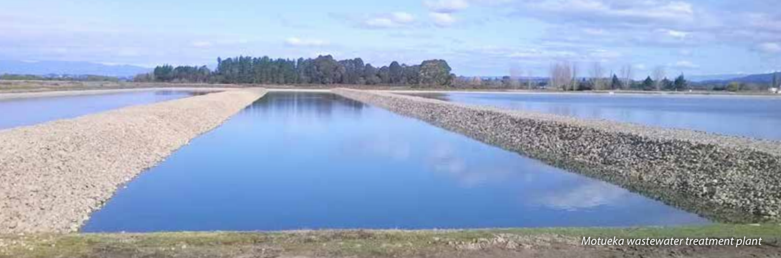
Motueka wastewater treatment plant