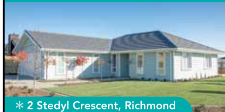
* 2 Stedyl Crescent, Richmond