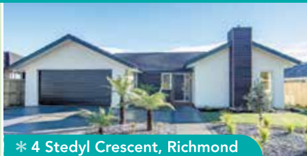
* 4 Stedyl Crescent, Richmond

2 & 4 Stedyl Crescent Richmond OPEN Monday to Friday 11.00am–4.00pm Saturday & Sunday 1.00pm–4.00pm