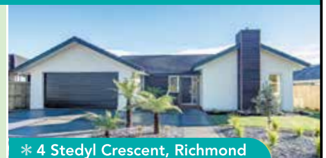
* 4 Stedyl Crescent, Richmond

2 & 4 Stedyl Crescent Richmond OPEN Monday to Friday 11.00am–4.00pm Saturday & Sunday 1.00pm–4.00pm