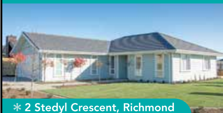
* 2 Stedyl Crescent, Richmond